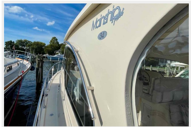
Mainship 34 - TLC - - 9