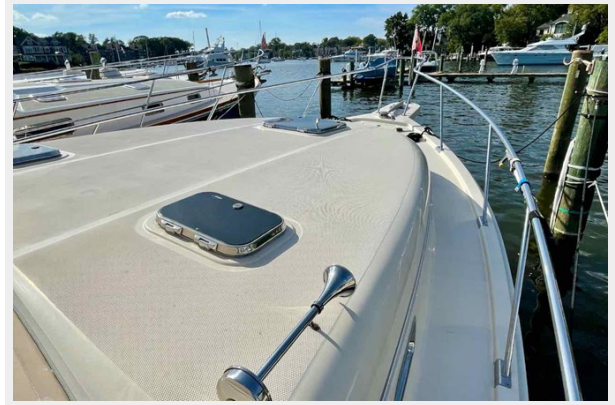
Mainship 34 - TLC - - 13