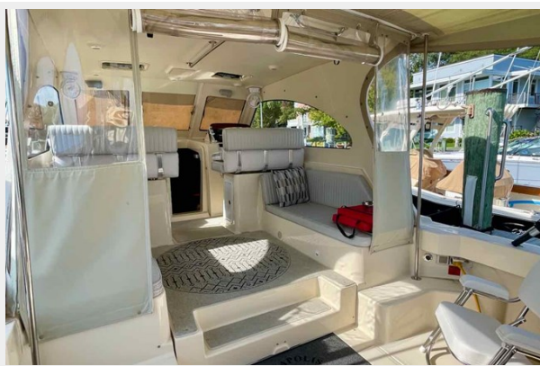
Mainship 34 - TLC - - 16