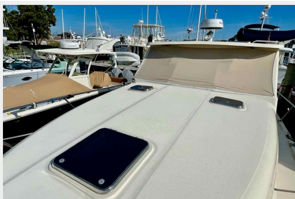
Mainship 34 - TLC - - 10