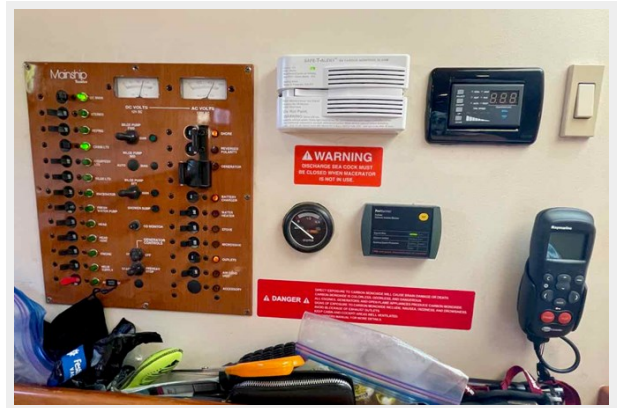
Mainship 34 - TLC - - 35