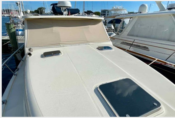
Mainship 34 - TLC - - 12