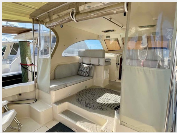
Mainship 34 - TLC - - 14