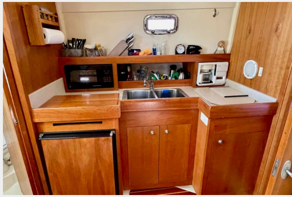
Mainship 34 - TLC - - 30