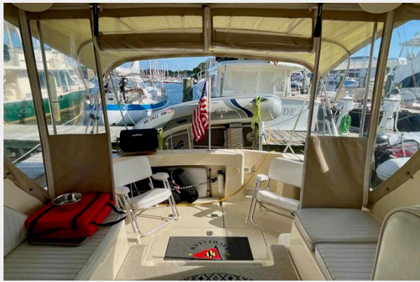
Mainship 34 - TLC - - 18