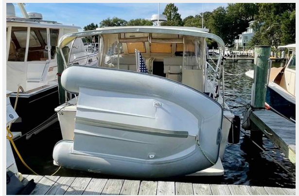
Mainship 34 - TLC - - 7