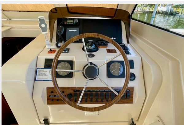
Mainship 34 - TLC - - 22