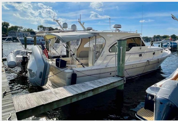
Mainship 34 - TLC - - 1