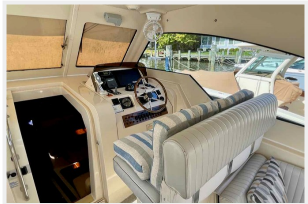
Mainship 34 - TLC - - 21