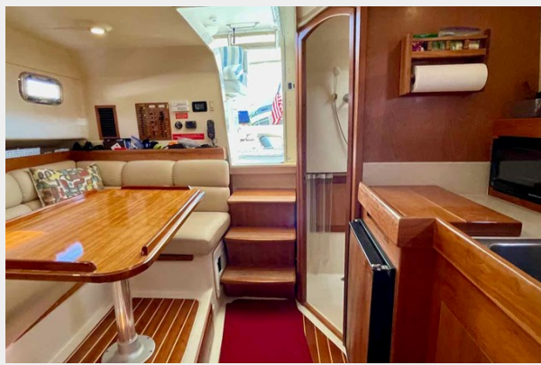
Mainship 34 - TLC - - 26