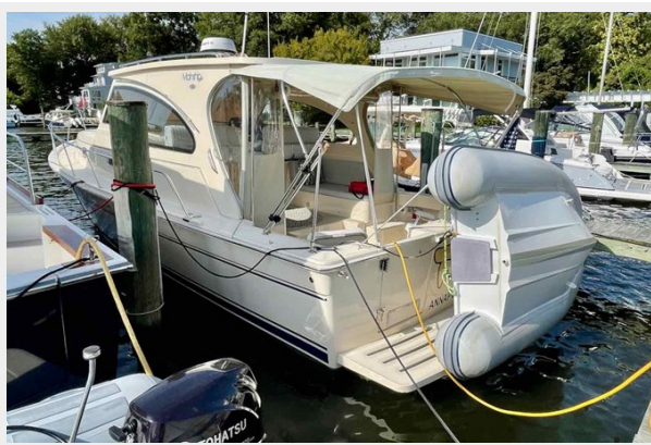
Mainship 34 - TLC - - 8