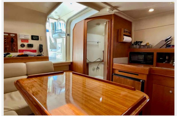
Mainship 34 - TLC - - 27