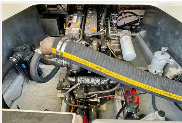
Mainship 34 - TLC - - 36