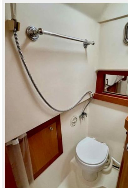
Mainship 34 - TLC - - 33