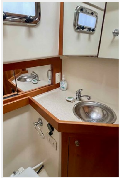
Mainship 34 - TLC - - 34