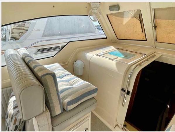
Mainship 34 - TLC - - 20