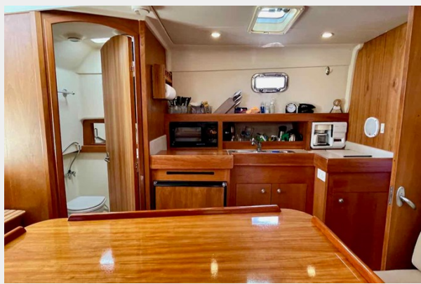
Mainship 34 - TLC - - 28