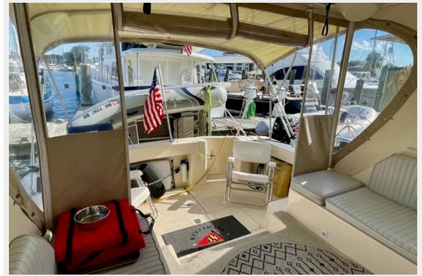
Mainship 34 - TLC - - 19