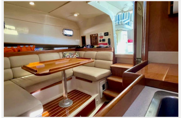
Mainship 34 - TLC - - 25