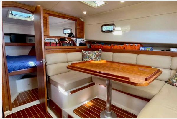
Mainship 34 - TLC - - 24