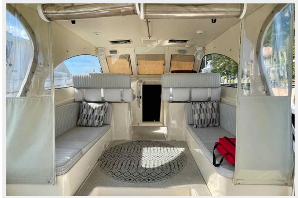
Mainship 34 - TLC - - 15