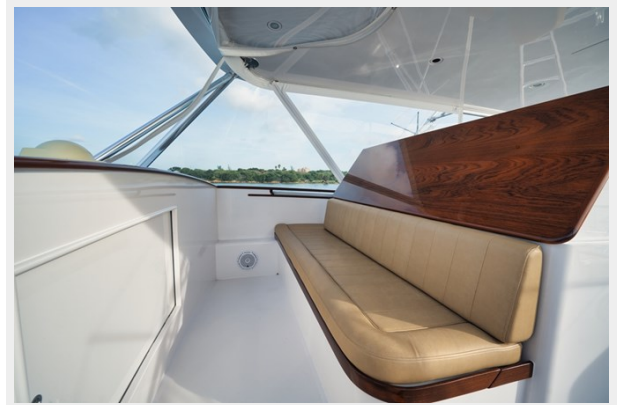
Flybridge Seating Forward