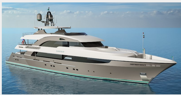
T-056 Rendering -4