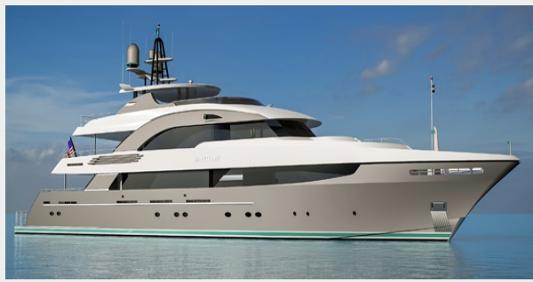
T-056 rendering 1