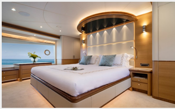
Master On deck 1