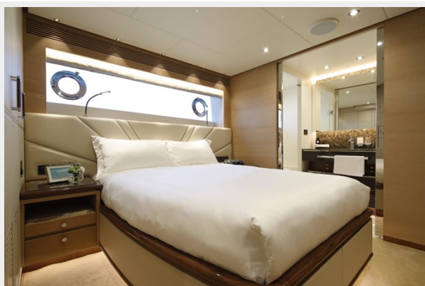
Guest Stateroom 2