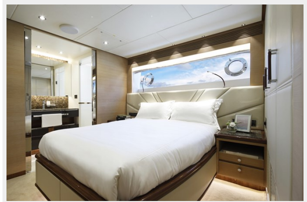
Guest Stateroom 1