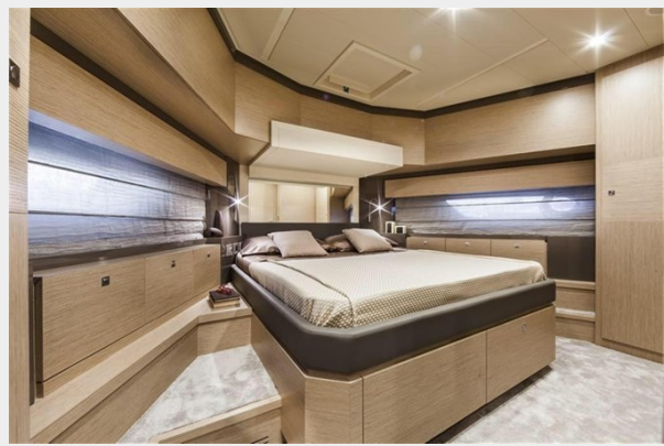
WhatsApp Image 2021-08-25 at 08.52.50 (5)