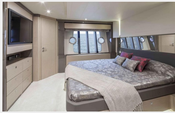
WhatsApp Image 2021-08-25 at 08.52.50 (3)