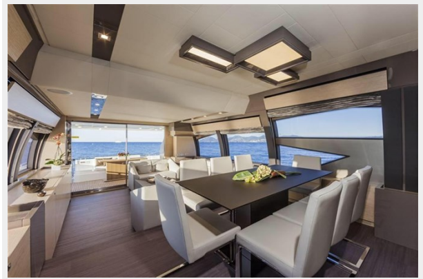
WhatsApp Image 2021-08-25 at 08.52.49 (2)