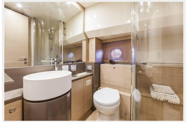
WhatsApp Image 2021-08-25 at 08.52.50 (4)