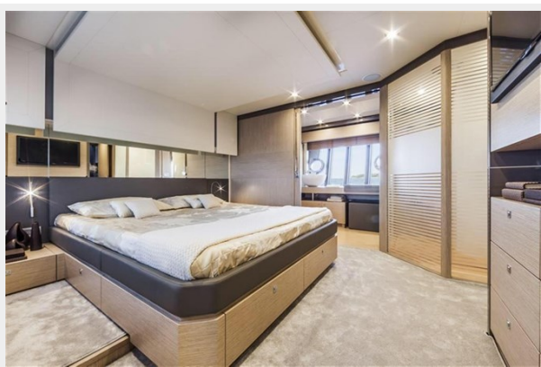
WhatsApp Image 2021-08-25 at 08.52.50