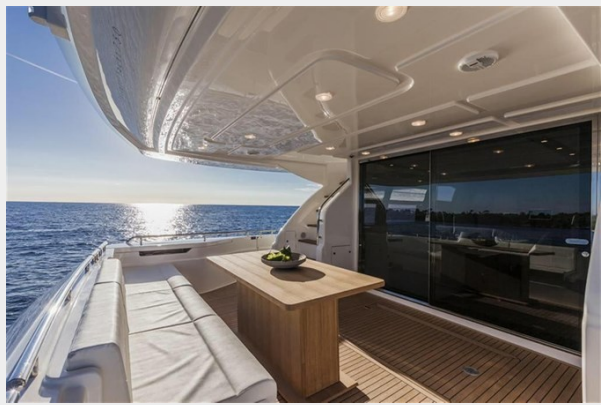
WhatsApp Image 2021-08-25 at 08.52.49 (1)