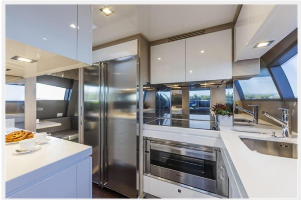
WhatsApp Image 2021-08-25 at 08.52.49 (4)