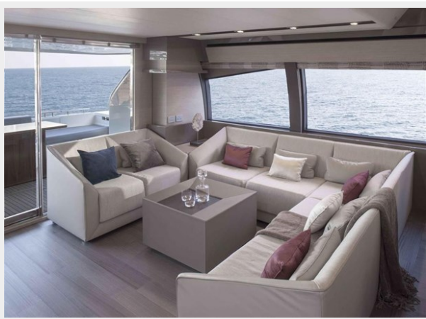
WhatsApp Image 2021-08-25 at 08.52.49 (3)