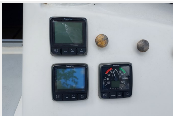
1020 All In Hunter 37.5 Sailing Instruments