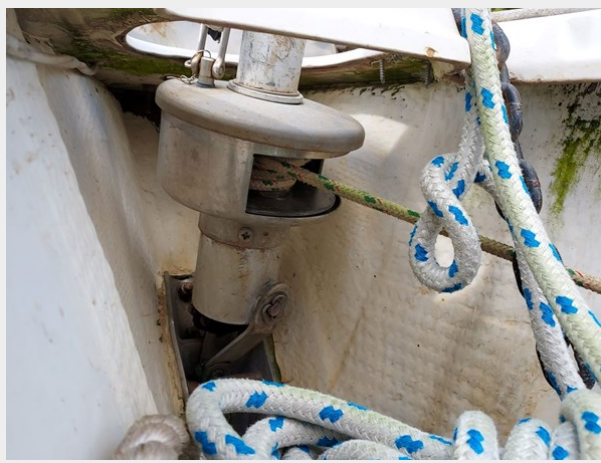
1015 All In Hunter 37.5 Below deck roller furling