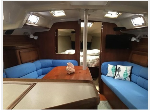
1029 All In Hunter 36.5 Salon