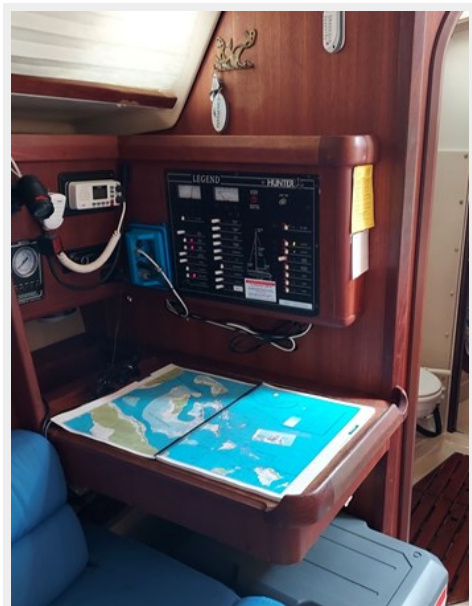
1034 All In Hunter 37.5 Nav Table