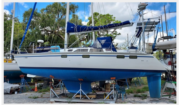
1006 All In Hunter 37.5