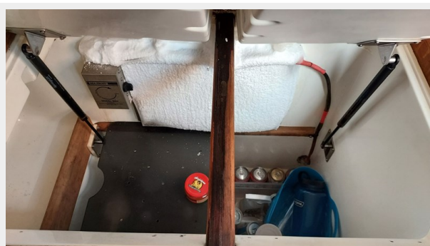
1038 All In Hunter 37.5 Refrigerator