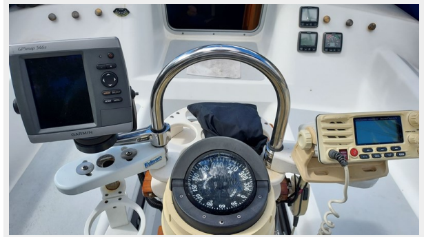
1023 All In Hunter 37.5 Helm