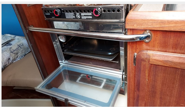
1042 All In Hunter 37.5 Oven