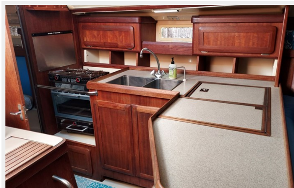
1035 All In Hunter 37.5 Galley