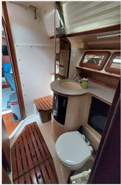
1050 All In Hunter 37.5 Aft Head