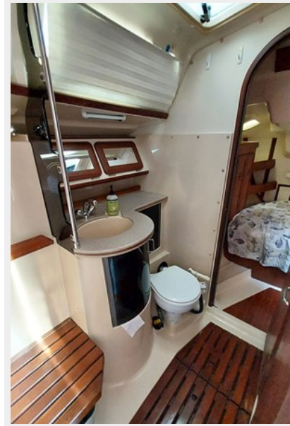
1051 All In Hunter 37.5 Aft Head