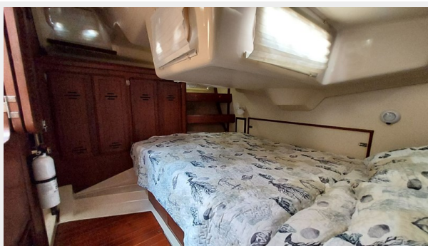
1046 All In Hunter 37.5 Aft Cabin Port