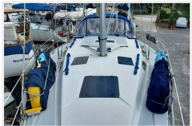
1016 All In Hunter 37.5