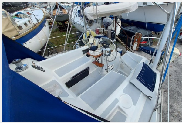
1011 All In Hunter 37.5