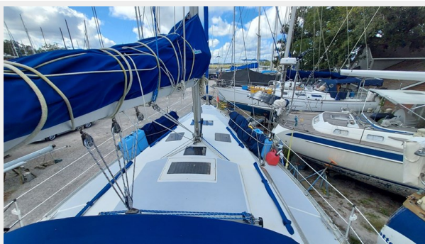
1009 All In Hunter 37.5