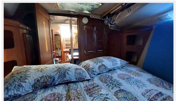
1063 All In Hunter 37.5 Fwd Cabin Aft