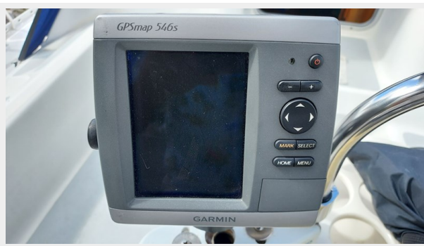
1024 All In Hunter 37.5 Chartplotter