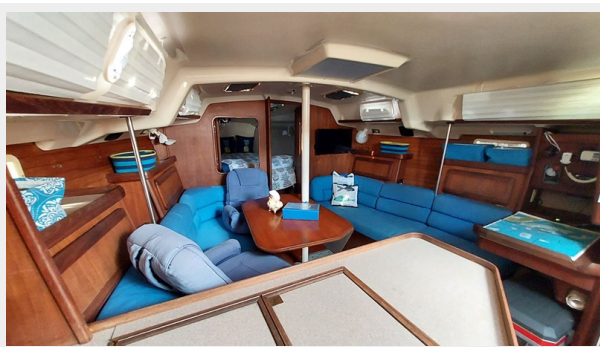
1032 All In Hunter 37.5 Salon