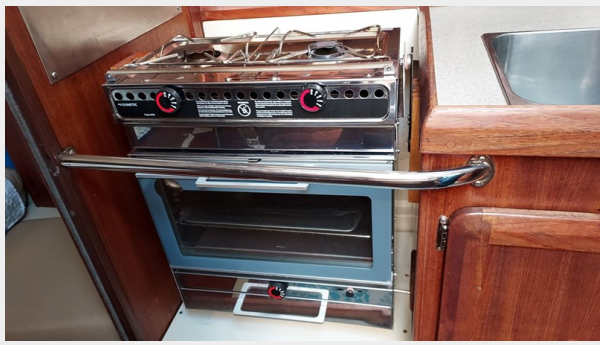
1040 All In Hunter 37.5 Alcohol Range