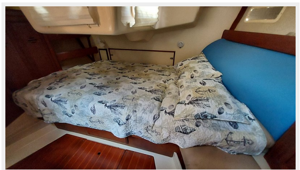
1045 All In Hunter 37.5 Aft Cabin