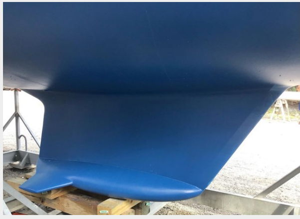
1028 All In Hunyer 37.5 Keel