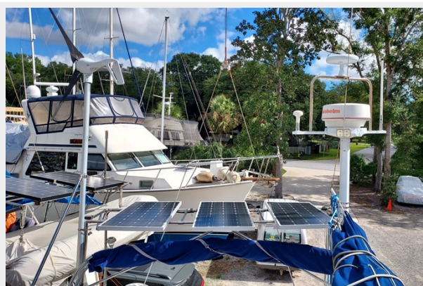
1026 All In Hunter 37.5 Solar panels and Wind Generator