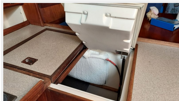
1037 All In Hunter 37.5 Refrigeration