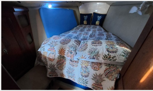
1060 All In Hunter 37.5 Fwd Cabin