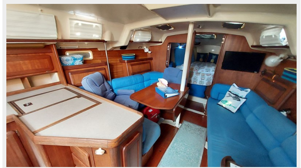
1031 All In Hunter 37.5 Salon