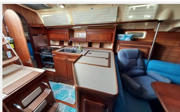
1036 All In Hunter 37.5 Galley wide