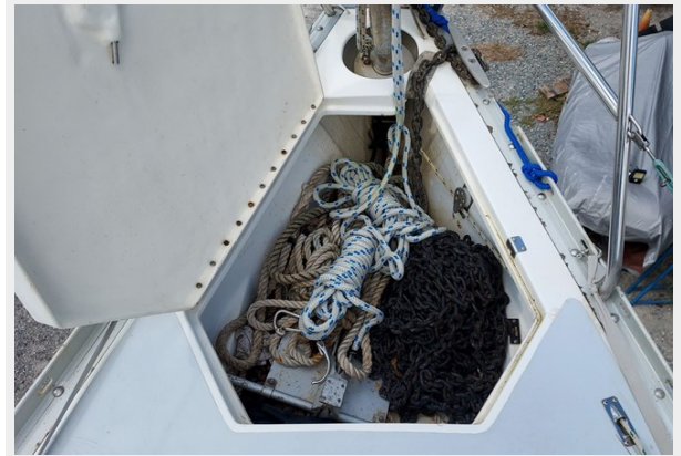
1012 All In Hunter 37.5