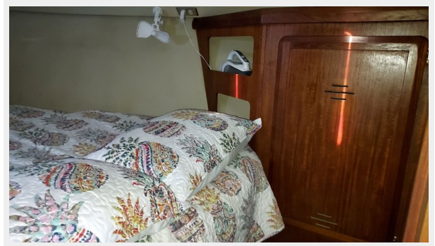
1061 All In Hunter 37.5 Fwd Cabin Starboard