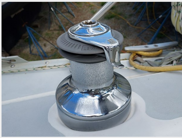
1022 All In Hunter 37.5 Primary Winch