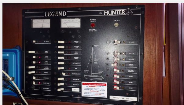
1070 All In Hunter 37.5 Distribution Panel