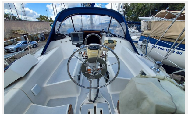
1008 All In Hunter 37.5