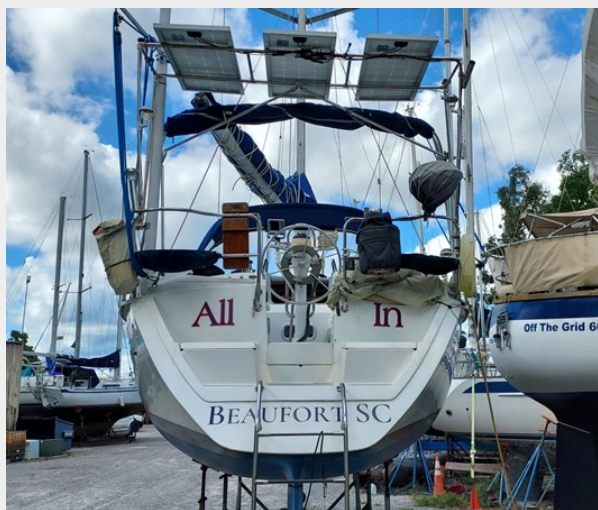
1007 All In Hunter 37.5