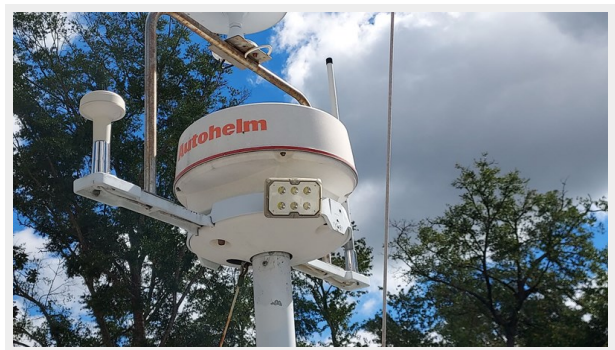
1025 All In Hunter 37.5 Antenna Array