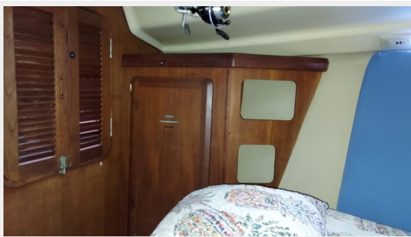
1062 All In Hunter 37.5 Fwd Cabin Port