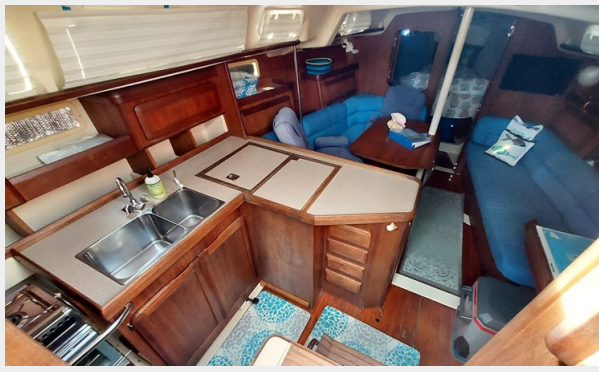
1030 All In Hunter 37.5 Cabin Entrance