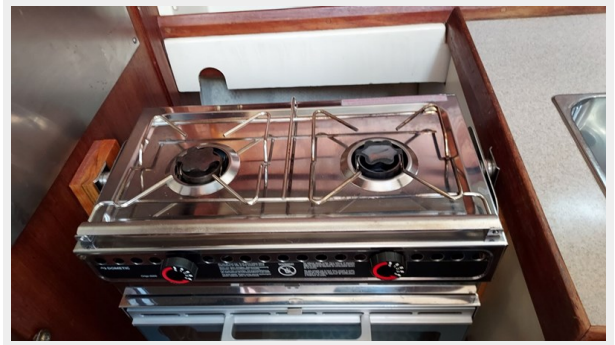
1041 Aii In Hunter 37.5 Stove top