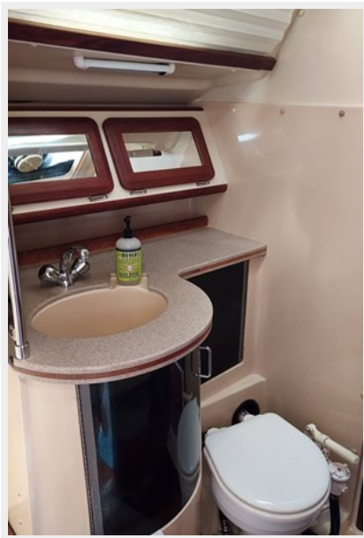
1052 All In Hunter 37.5 Aft Head