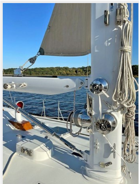
Mast and Boom