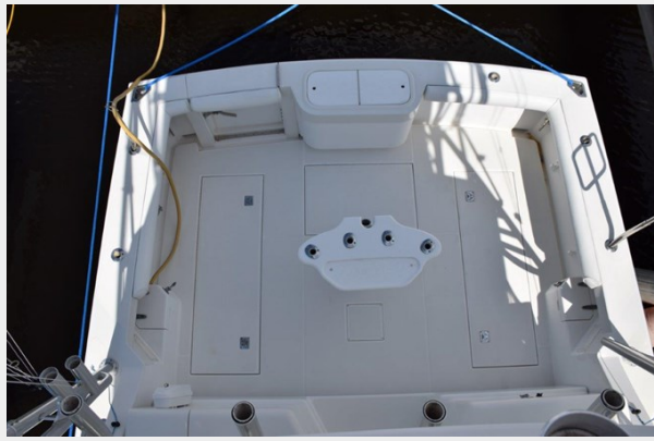
Cockpit view from tower