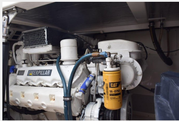
CAT 3208STA portside