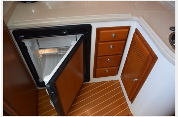
Refrigerator Freezer, drawer storage