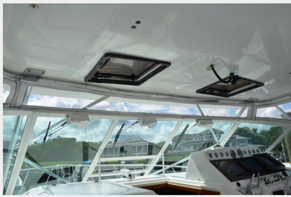
Hardtop hatches and windshield wipers