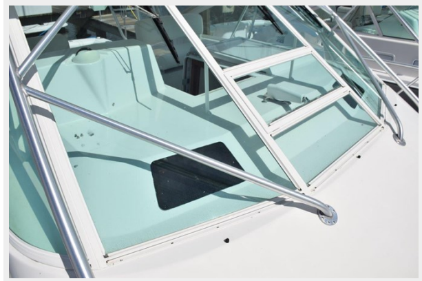
Tinted helms window and electric opening vent