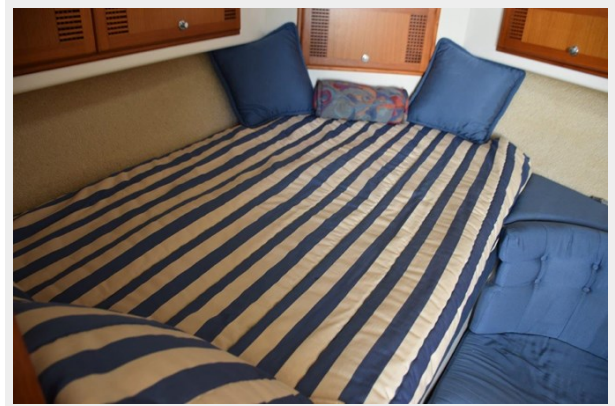
Double berth - rod storage in cove lockers