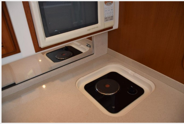
Hideaway stovetop, microwave