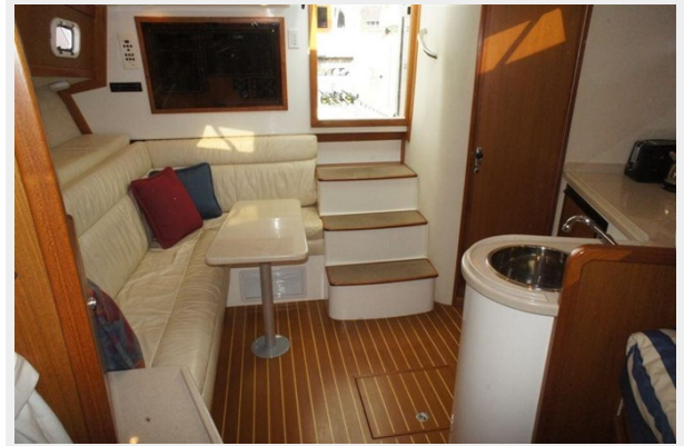
Cabin view aft