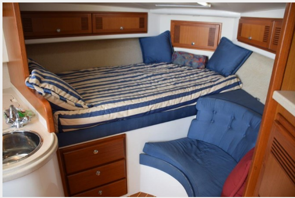
Berth and lounge seat