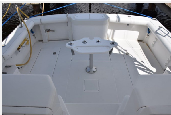
Cockpit view from helm