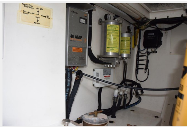
Forward starboard engine room bulkhead