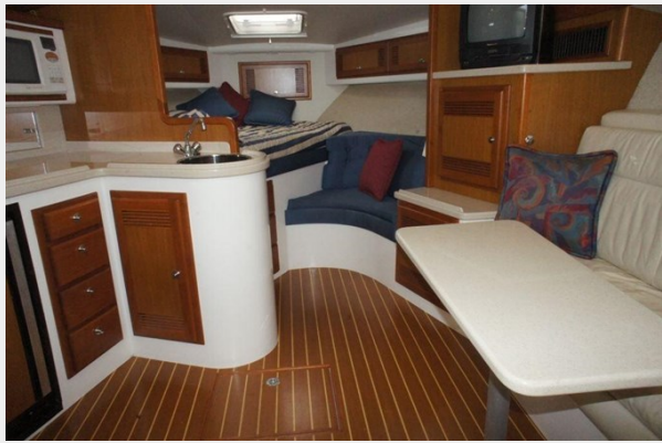
Cabin view forward