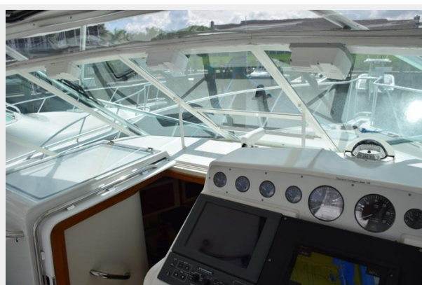
Cabin entry and chart table