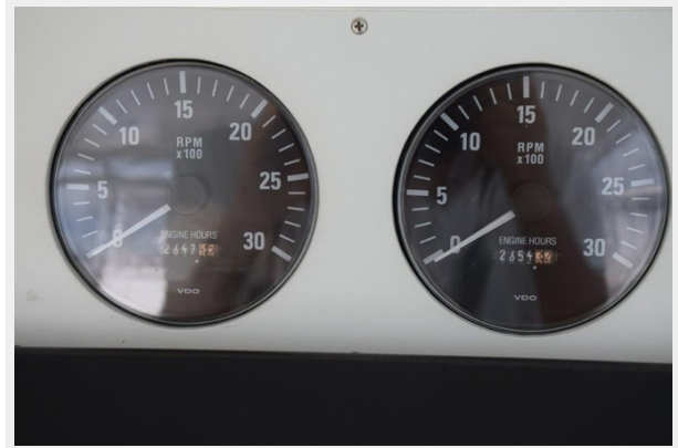
Engine hours - tachometers