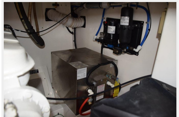
Water heater and fresh water pump