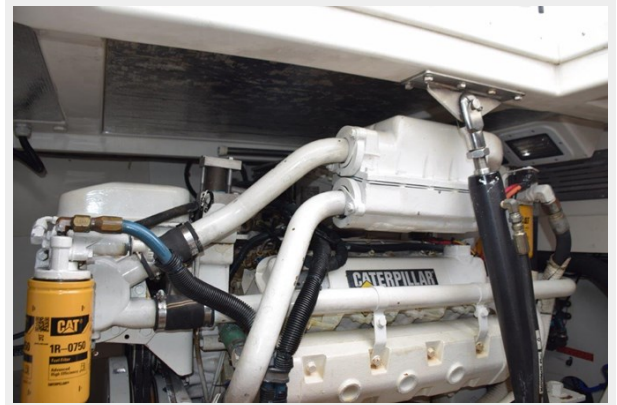
CAT 3208STA starboard