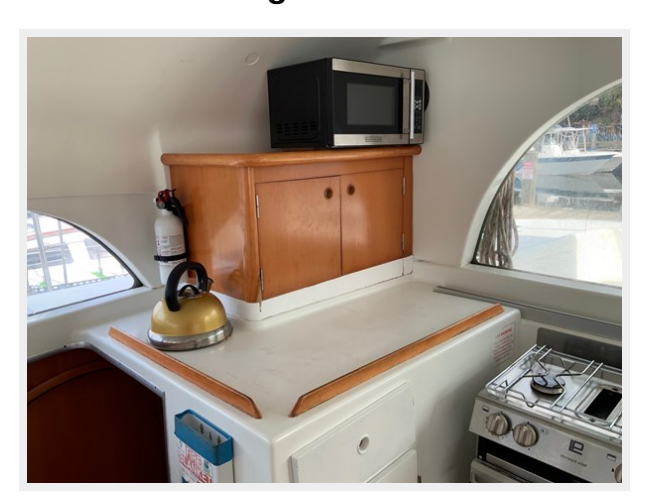
Lagon 380 3