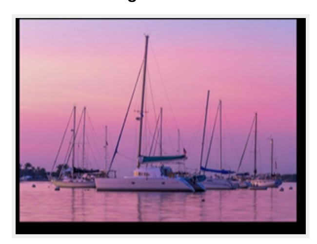
Lagoon 380 1