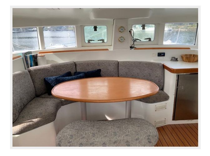
Lagoon 380 4