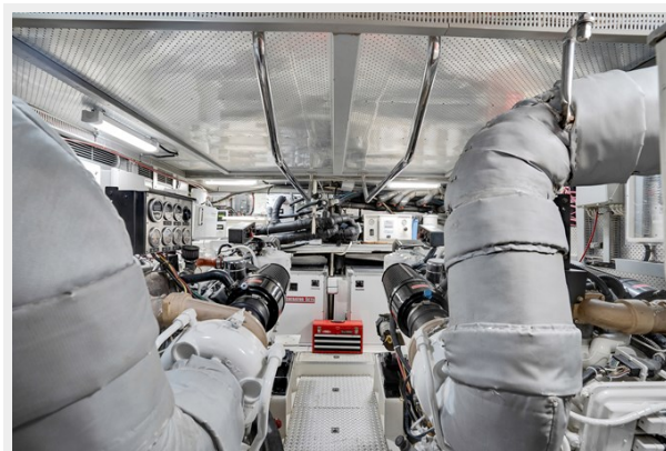
Engine Room facing Forward