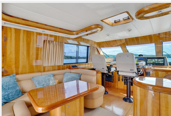
Command Bridge facing Forward Port