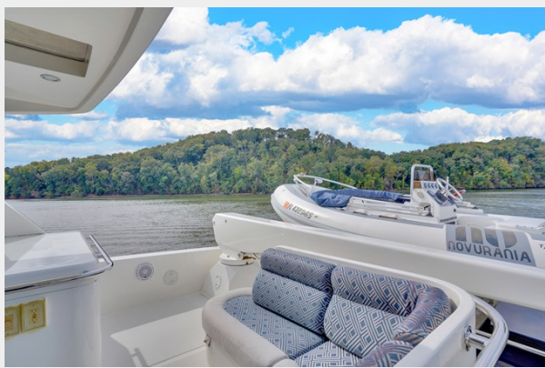
Upper Aft Deck and Tender