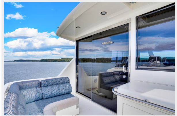
Upper Aft Deck facing Port