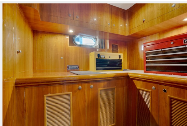
Crew Utility Area