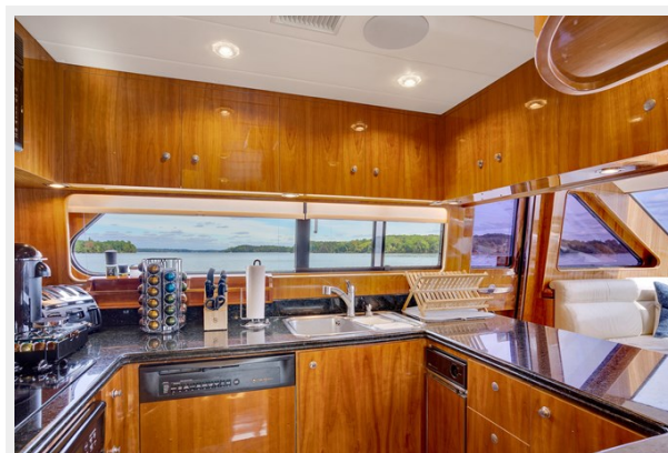
Galley facing Port