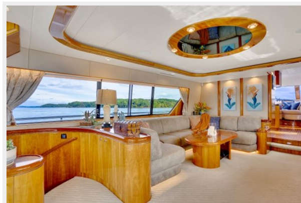
Salon Aft stairs to Crew Deck