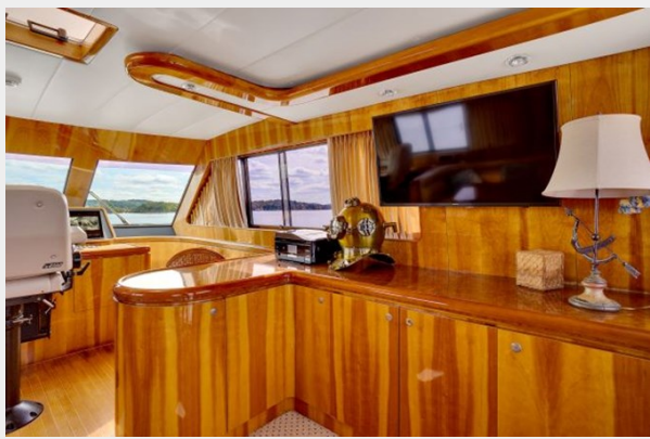
Command Bridge facing Starboard