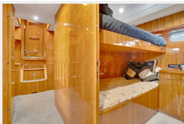
Crew Cabin facing Aft