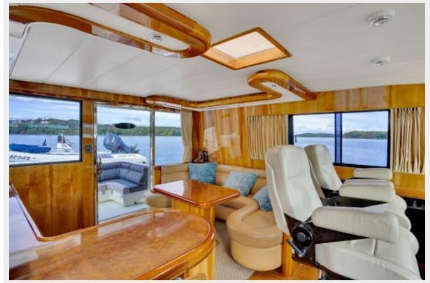
Command Bridge facing Aft Port