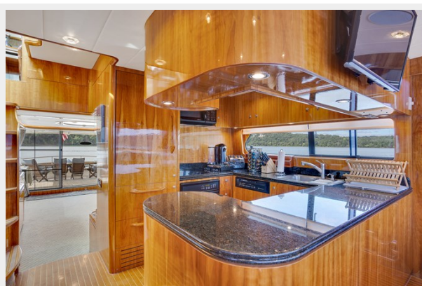
Galley facing Aft