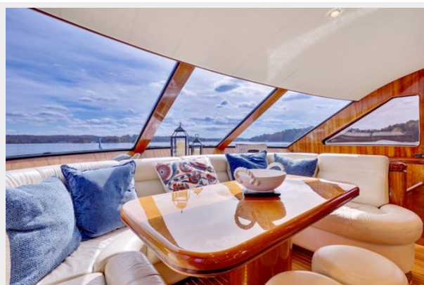
Dining Area facing Forward