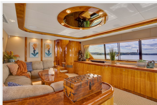
Salon facing Starboard