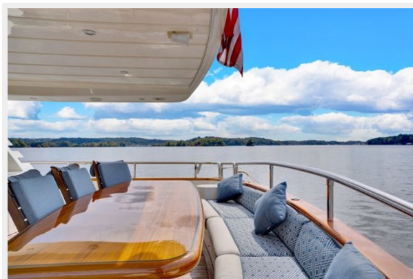
Aft Deck facing Starboard