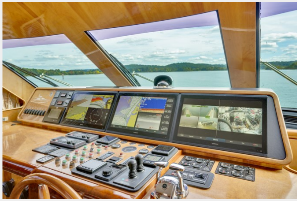
Command Bridge Helm