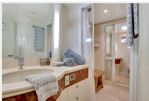
MSR Heads and Shower