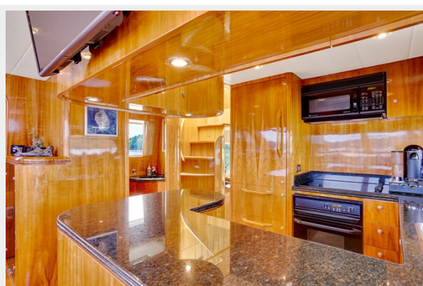
Galley and Day Head facing Aft Starboard