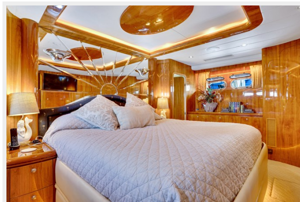
MSR facing Aft Port