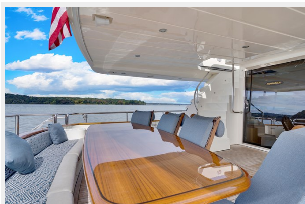
Aft Deck facing Port