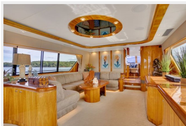
Salon facing Forward