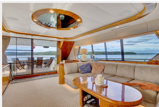
Salon Facing Aft Portside