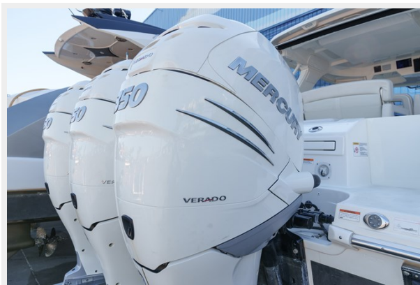
Triple engines view from stbd