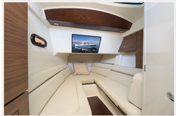
Opposing seating in the cabin that converts to a berth