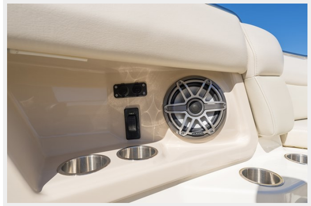
Speaker and cup holders in the bow area