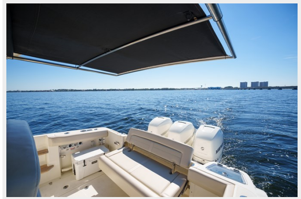
Aft cockpit with electric retractable sunshade