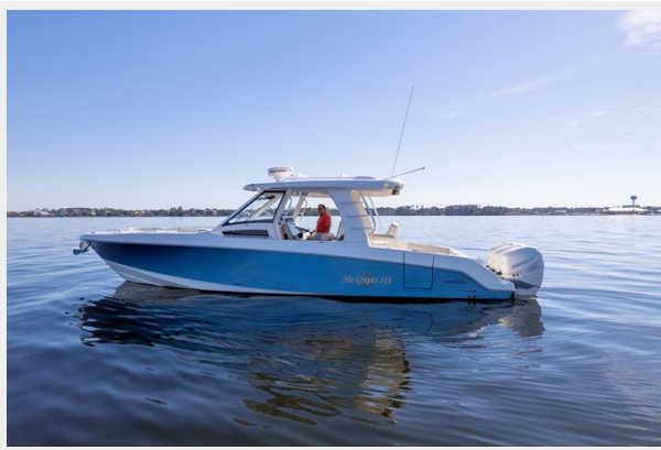
Port profile 2