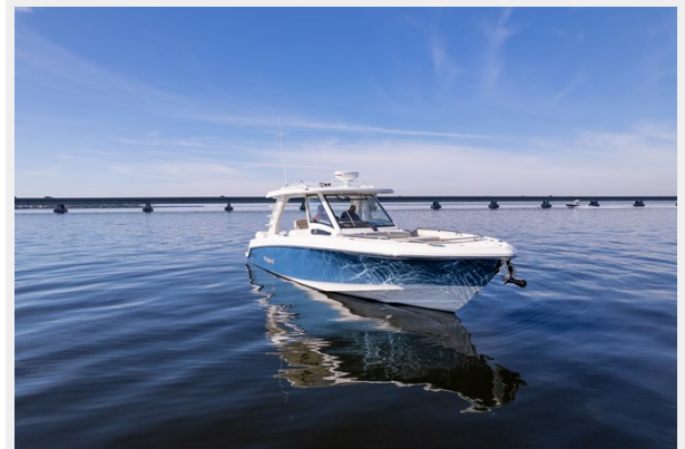
Stbd bow profile