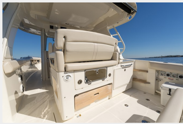
Cockpit/Helm deck second row reversible seat