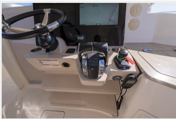
Mercury throttle control and joystick control with Skyhook