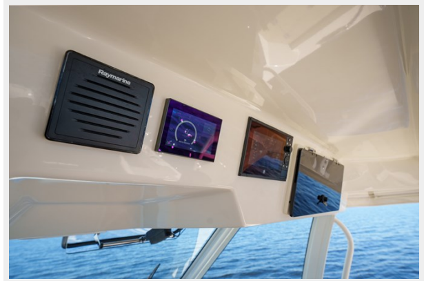
Additional electronics at the helm