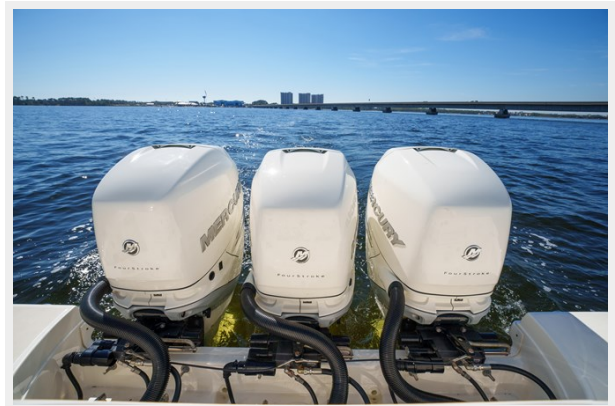
Triple engines view 2