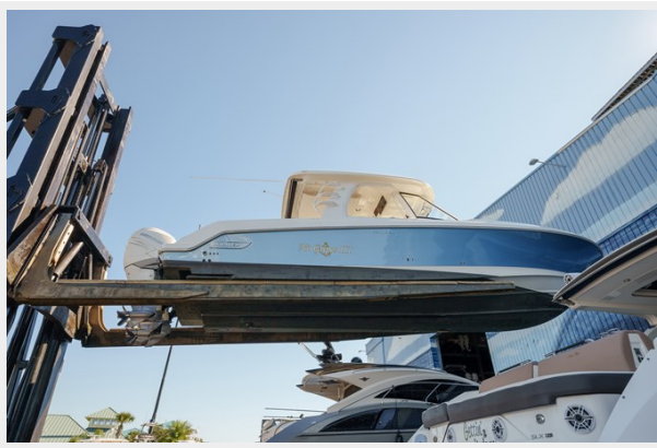
Stbd profile (on lift)