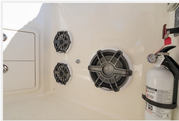
JL Audio speakers at the stbd helm deck counter