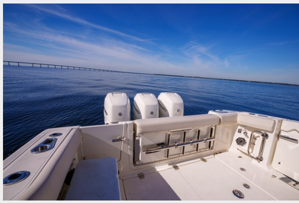
Aft cockpit view 2