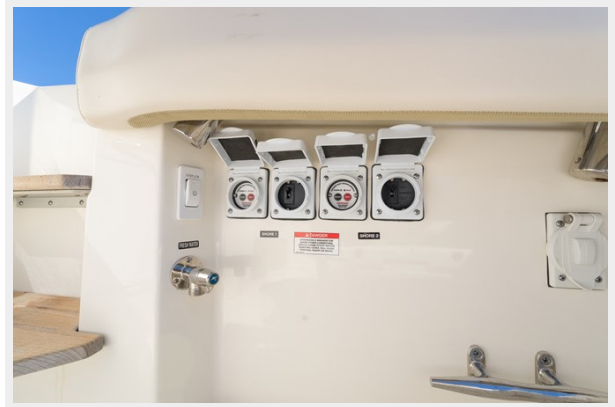
Ground fault sensing modules and Marinco switches