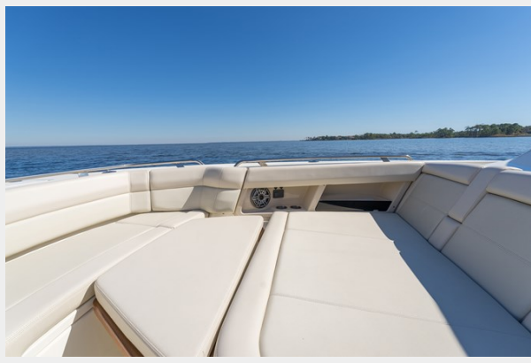
Bow seating with filler