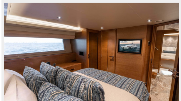
Port Double Stateroom