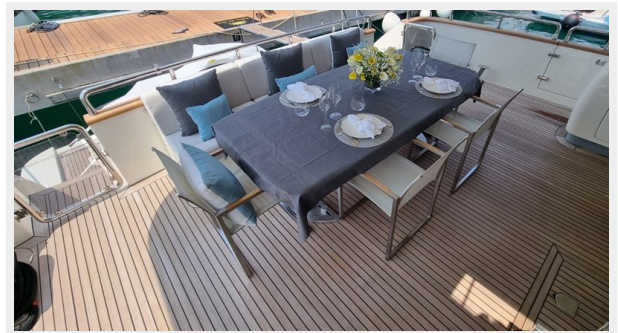
CANADOS 86_AFT COCKPIT