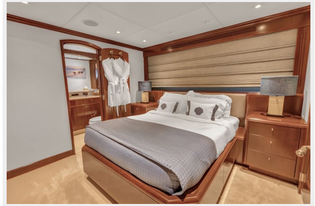
VIP Starboard Stateroom