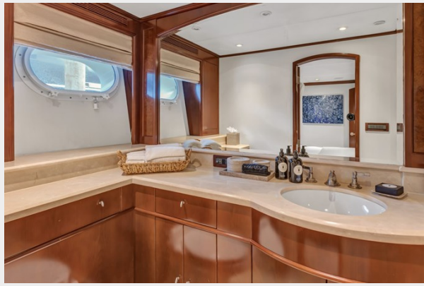
VIP Port Stateroom Ensuite