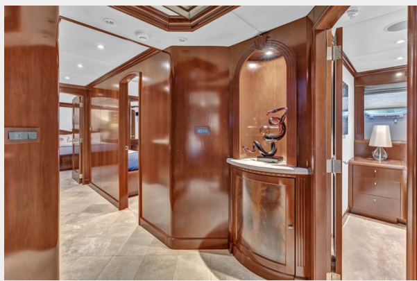
Lower Deck Foyer