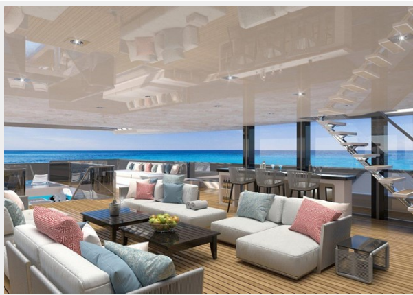
MAXIMUS_outdoor lounge 01