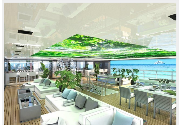
MAXIMUS_outdoor lounge 02