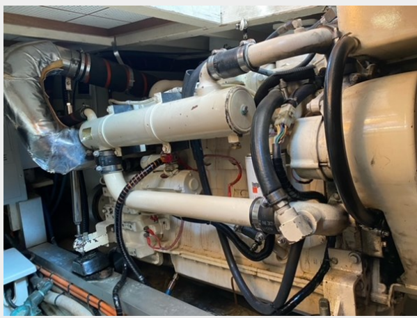
17-engine room 3