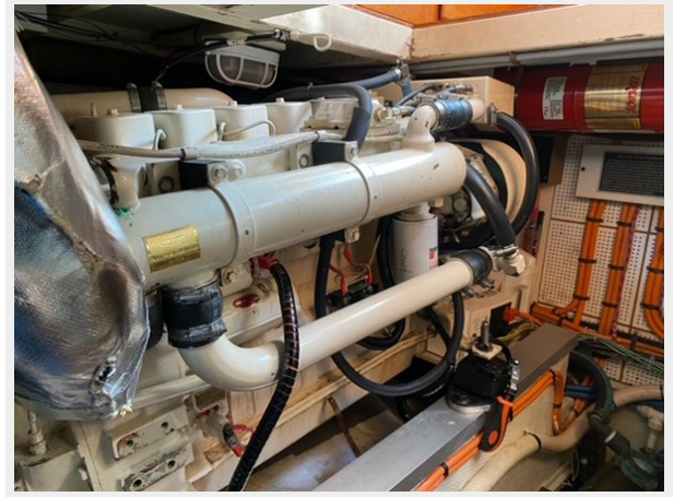
16-engine room 2