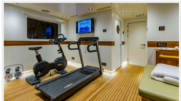
Maybe 005 Ir