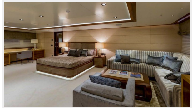
Maybe 015 Ir