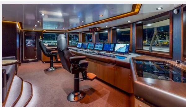
Maybe 019 Ir