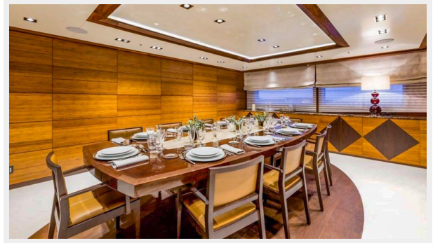
Maybe 012 lr