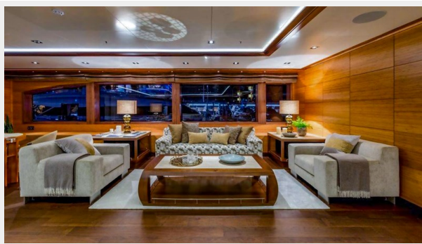
Maybe 011 lr