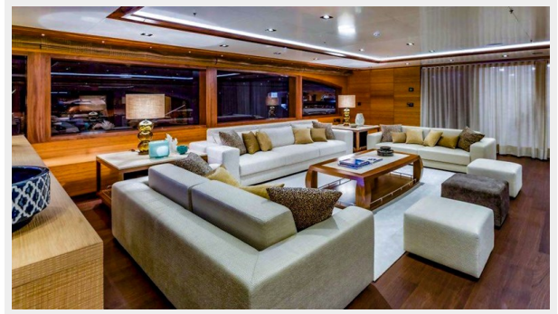
Maybe 009 lr