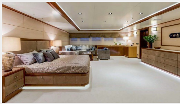
Maybe 014 Ir