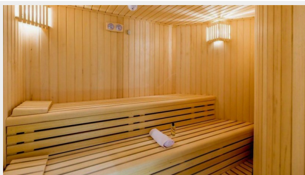
Maybe 018 Ir