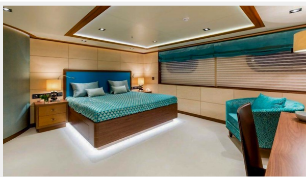
Maybe 016 Ir