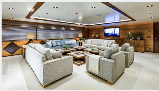
Maybe 007 lr