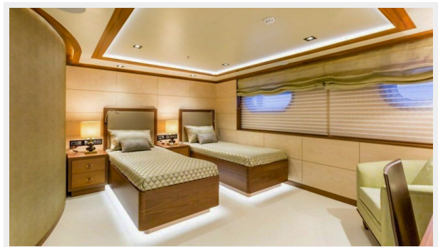
Maybe 017 Ir