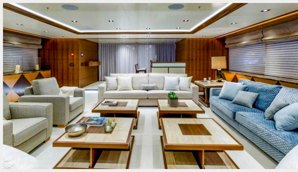
Maybe 008 lr