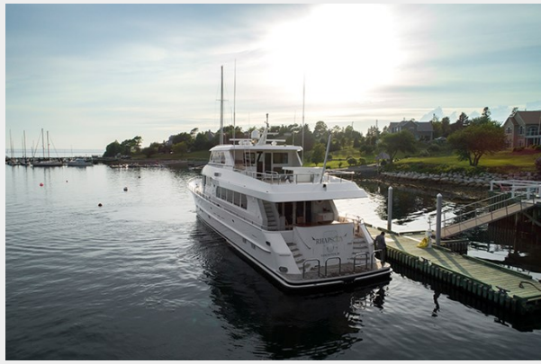
Port Stern Profile