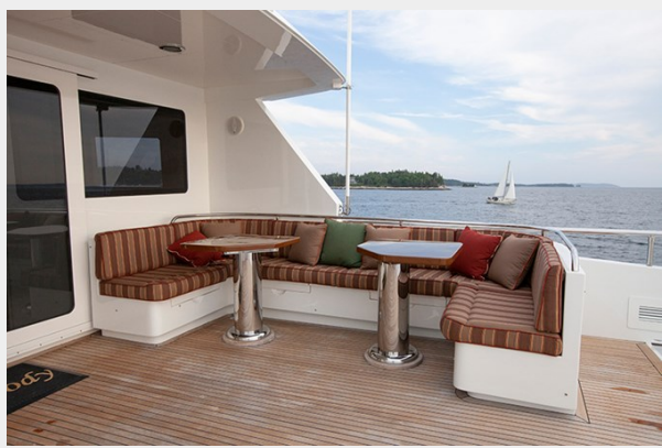
Upper Deck Seating