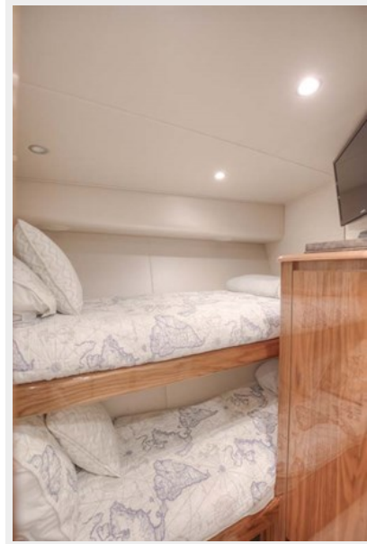
Guest Twin Bunk Berths