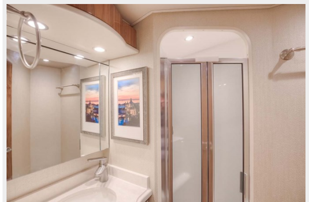
Guest Head and Shower