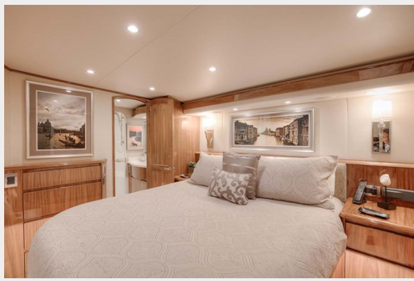
Beautiful Maple Finish Cabinetry