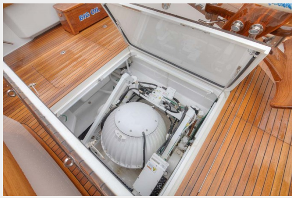
Seakeeper Gyro SK 26