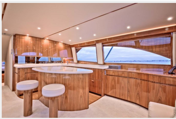
Two Bar Stools and Galley