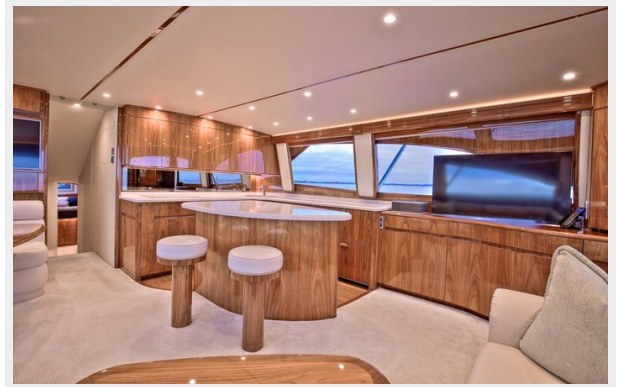
Salon and Flat Screen TV