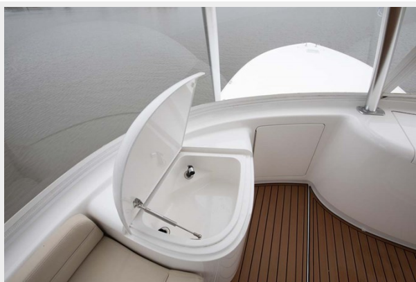
Flybridge Port Forward Wet Bar