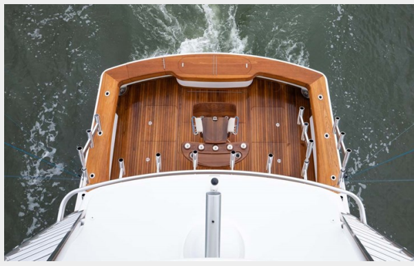
Tower View to the Cockpit