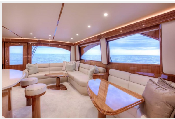
Main Salon to Port