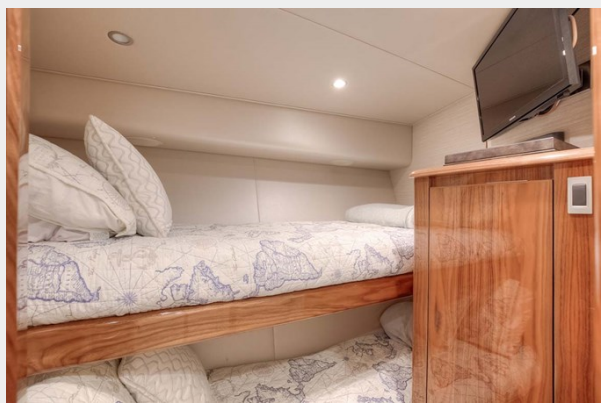
Guest Flat Screen TV