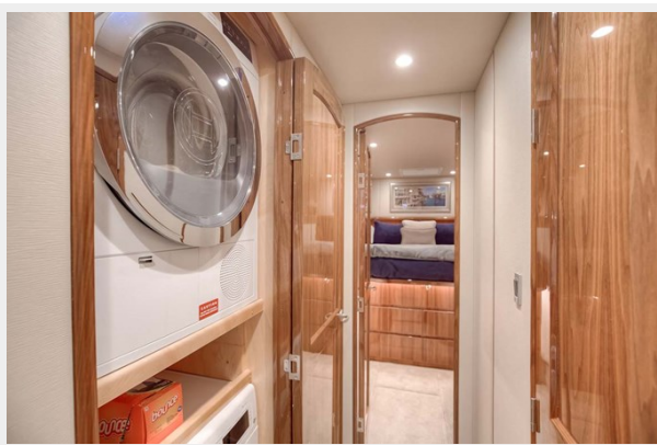
Washer and Dryer and VIP Stateroom