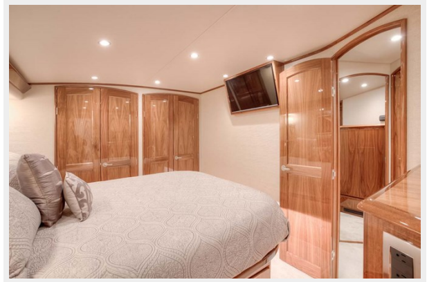
Master Stateroom View to Flat Screen TV