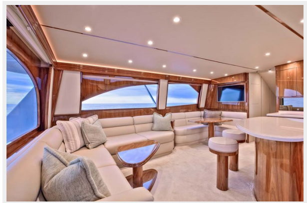
Salon Settee to Port Aft