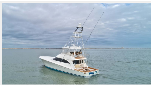
Port Aft Quarter