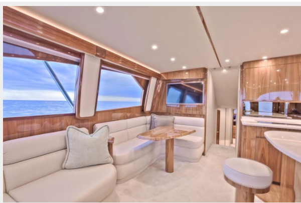
Salon Settee and Dinette