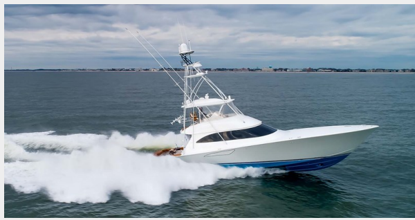
Starboard Running Profile