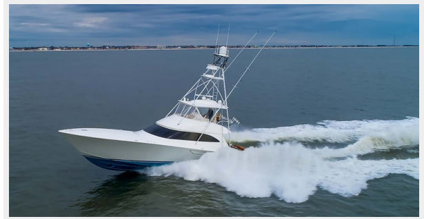
Port Running Profile