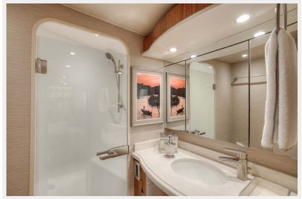
One-Piece Custom Frameless Shower Door