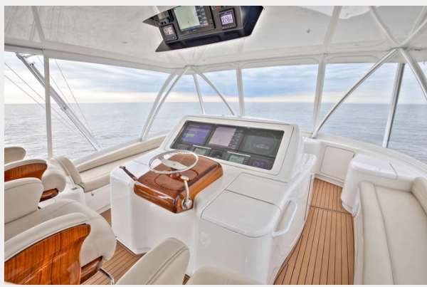
Helm Station with Overhead Electronics