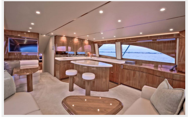
Salon Starboard Side Galley View