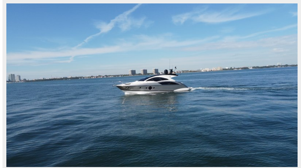
Snapshot 2022-01-07 18.41.41