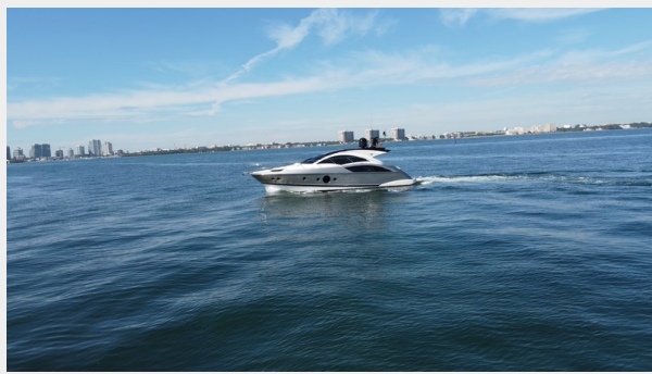
Snapshot 2022-01-07 17.30.55