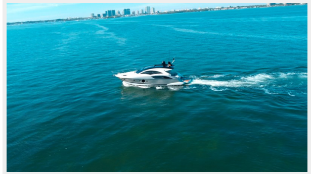
Snapshot 2022-01-07 17.31.04