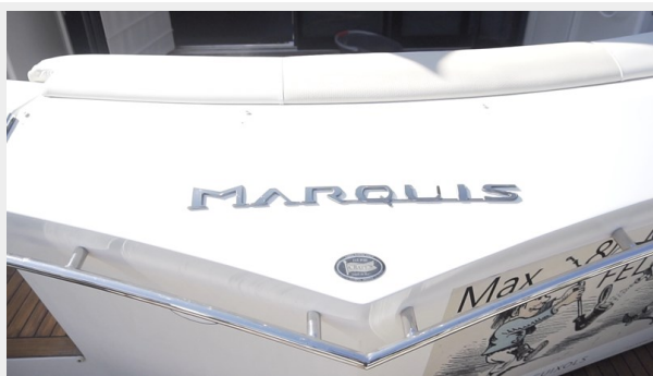
Snapshot 2022-01-07 17.04.00