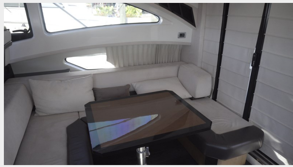
Snapshot 2022-01-07 18.38.59