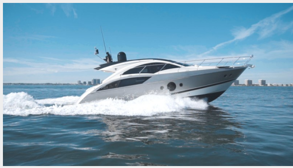
Snapshot 2022-01-07 18.40.04