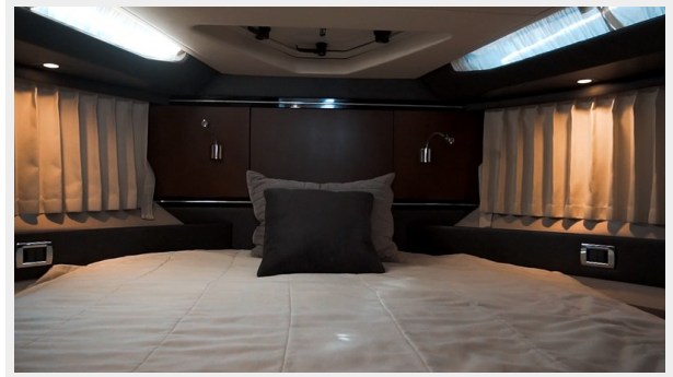
Snapshot 2022-01-07 18.39.29