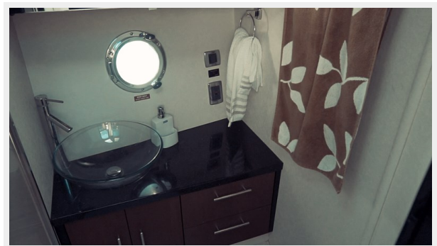
Snapshot 2022-01-07 18.39.52