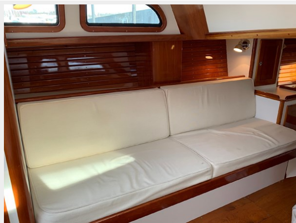
Main Cabin Port