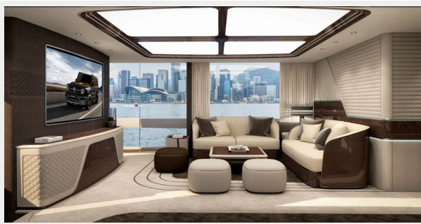
Dynamiq GTM90TF int3