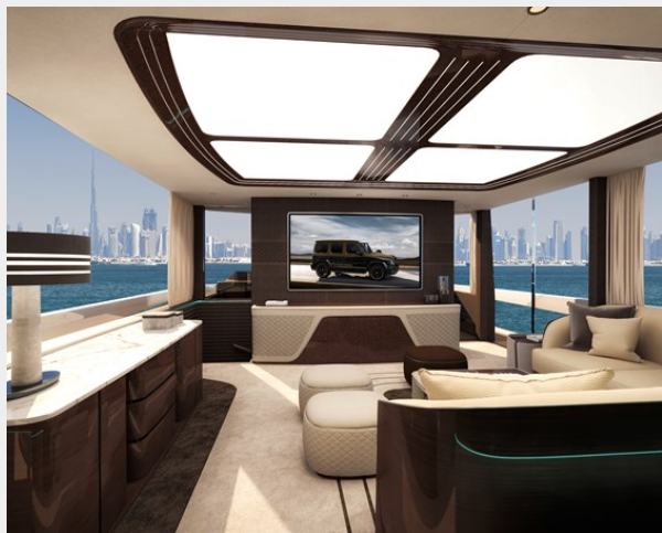
Dynamiq GTM90TF int1