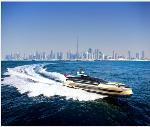
Dynamiq GTM90TF 001