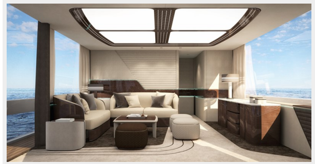
Dynamiq GTM90TF int2