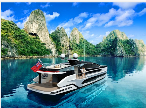
Dynamiq GTM90TF 003