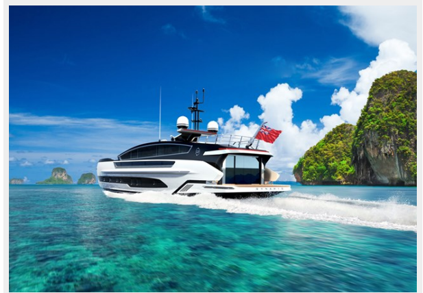
Dynamiq GTM90TF 002