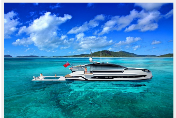
Dynamiq GTM90TF 004