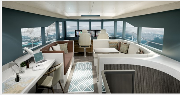
Upper Deck FWD View