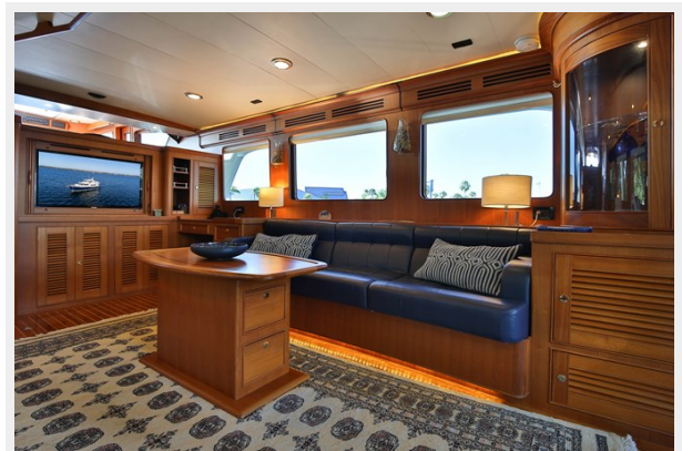
Salon facing Starboard