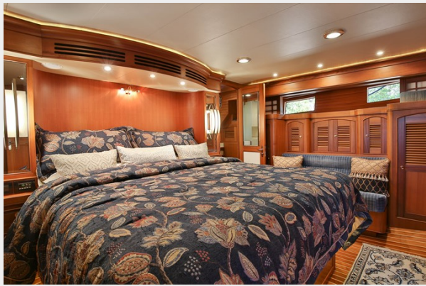
MSR Facing Aft Portside