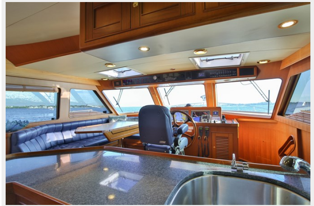
Pilothouse facing Forward Port