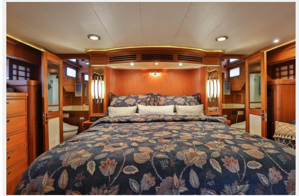
MSR facing Aft