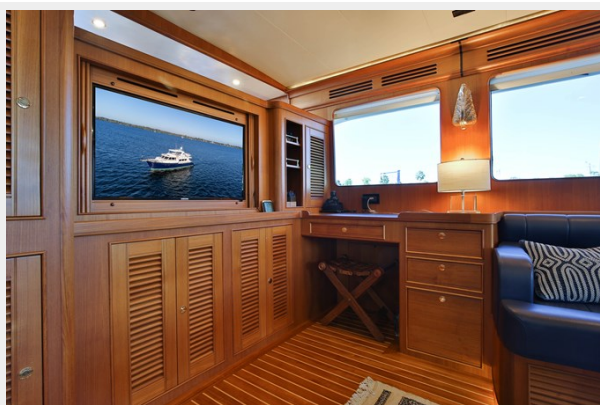
Salon TV and Desk