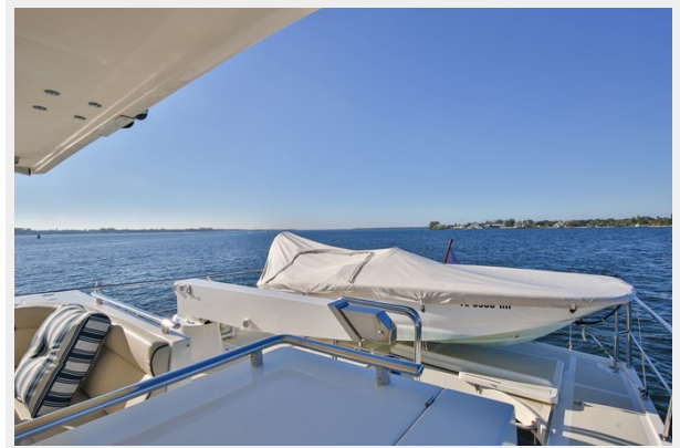
Davit and Tender