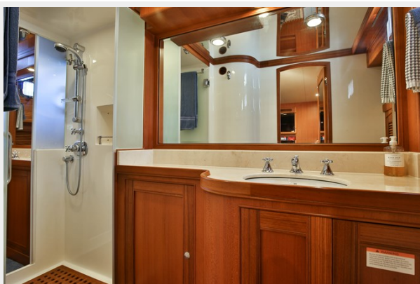
MSR Portside Head and Shower