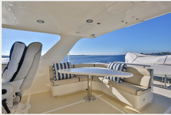
Flybridge Dining Area