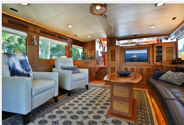
Salon facing Forward Port