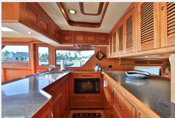
Galley facing Starboard