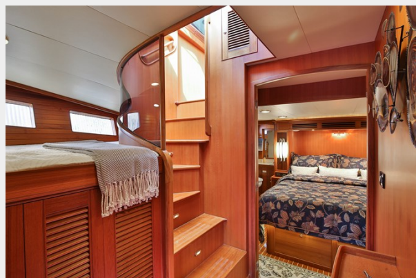
Companionway facing Aft Starboard