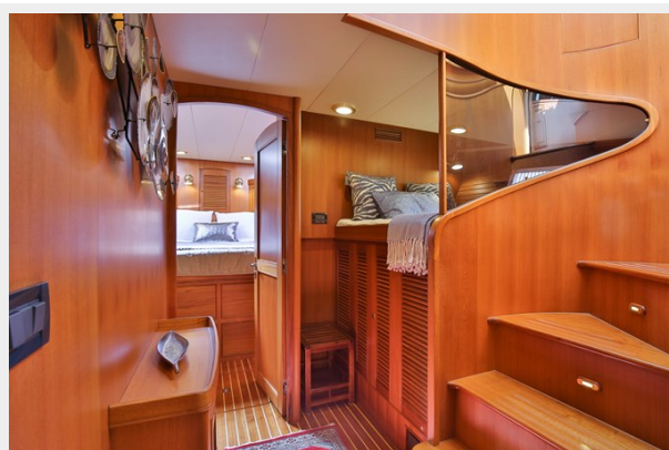
Companionway facing Forward