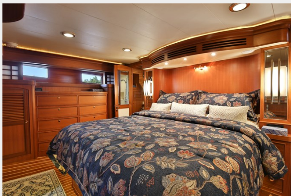
MSR facing Aft Starboard