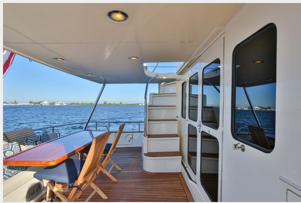
Aft Deck facing Portside