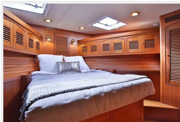
VIP facing Forward Starboard