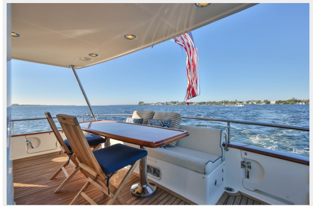
Aft Deck facing Starboard