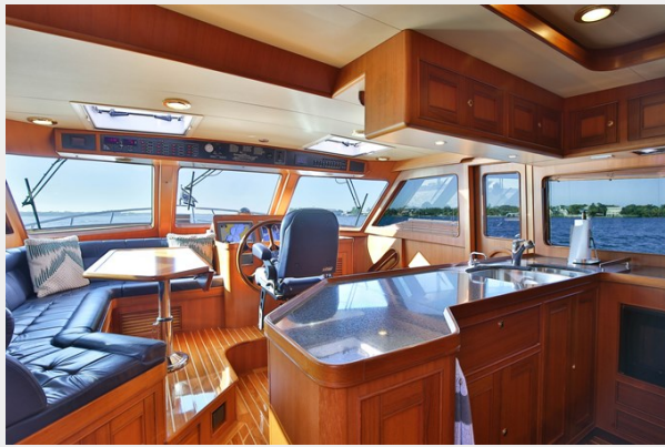
Pilothouse facing Forward