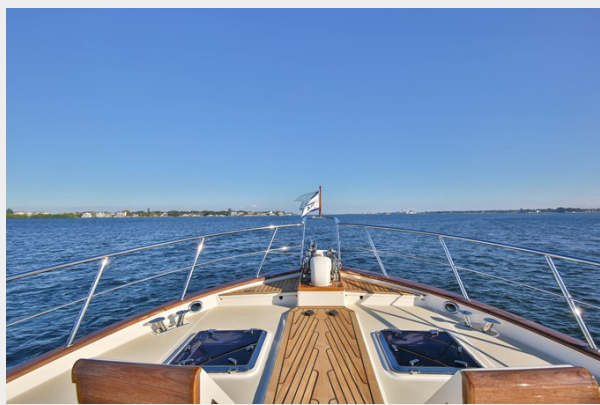
Bow facing Forward