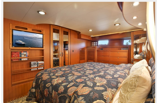
MSR facing Forward Starboard