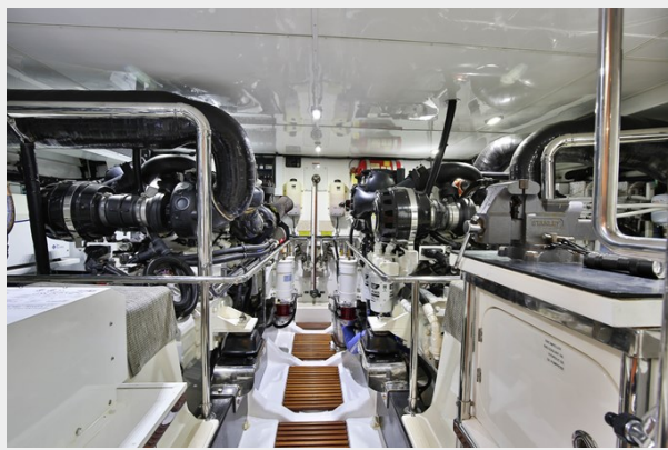
Engine Room facing Aft