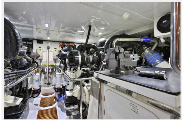
Engine Room Portside