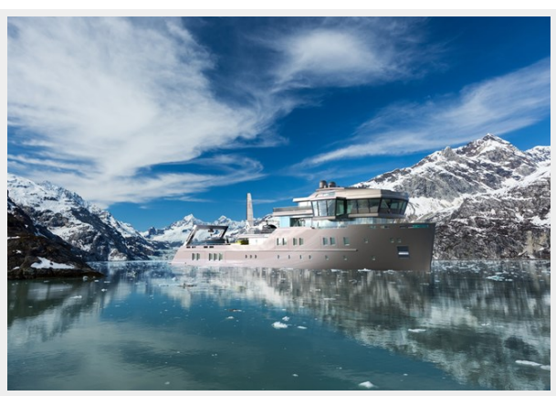
Doerries 70 Explorer (1)