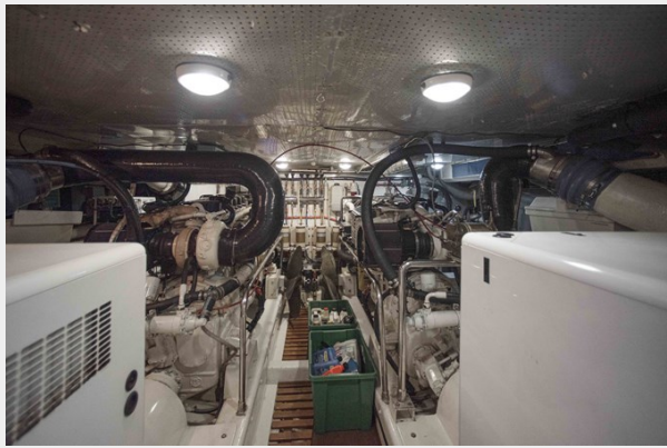
Engine Room Looking Forward