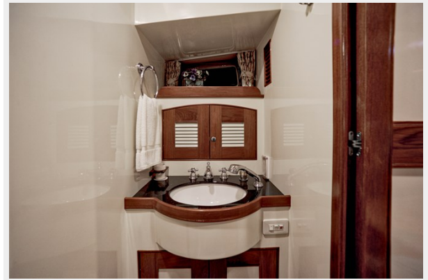
Port Guest Head