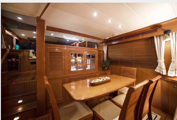
Dining Room Table