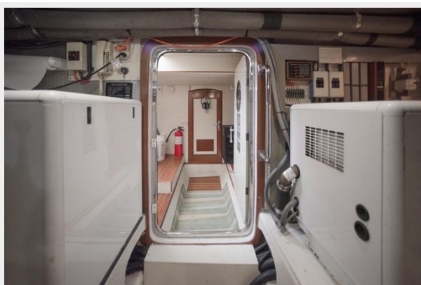
Generators Aft Engine Room