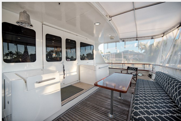
Aft Deck Seat