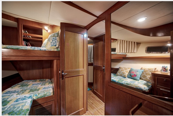
Port Guest looking Forward