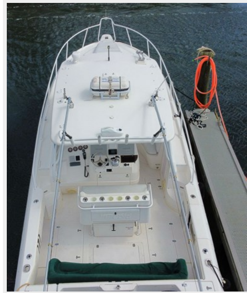
WhatsApp Image 2022-01-14 at 12.54.59 AM