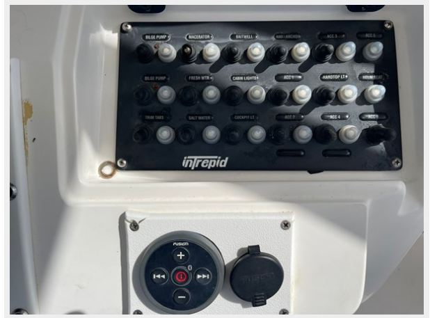
WhatsApp Image 2022-01-14 at 12.50.57 AM WhatsApp Image 2022-01-14 at 12.50.45 AM