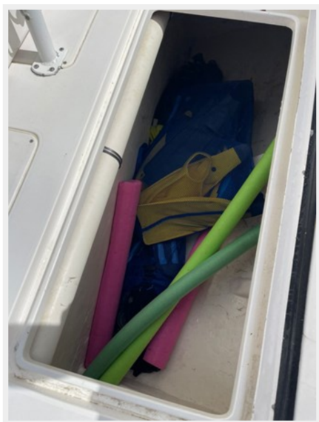
WhatsApp Image 2022-01-14 at 12.52.48 AM (1)