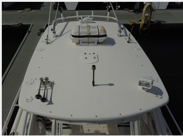
WhatsApp Image 2022-01-14 at 12.54.49 AM