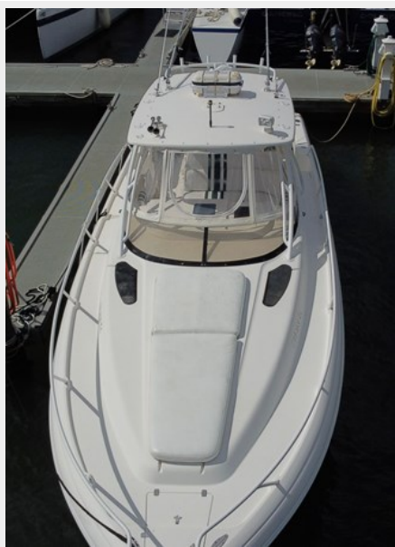
WhatsApp Image 2022-01-14 at 12.55.02 AM