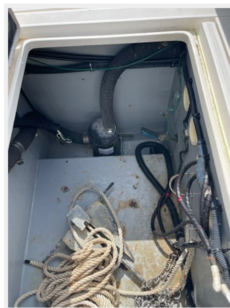
WhatsApp Image 2022-01-14 at 12.52.48 AM WhatsApp Image 2022-01-14 at 12.52.41 AM