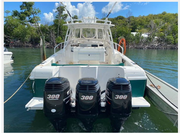
WhatsApp Image 2022-01-14 at 12.55.05 AM