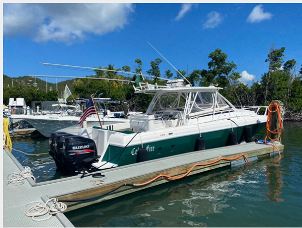
WhatsApp Image 2022-01-13 at 5.36.22 PM