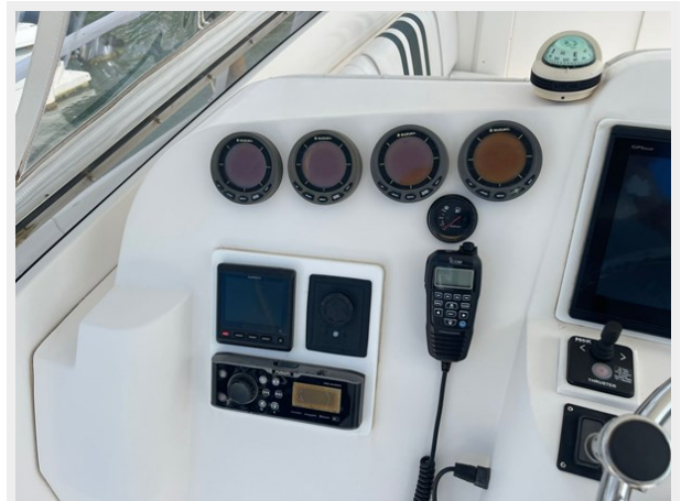
WhatsApp Image 2022-01-14 at 12.51.18 AM WhatsApp Image 2022-01-14 at 12.51.07 AM