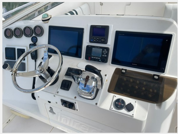
WhatsApp Image 2022-01-14 at 12.51.18 AM (1)