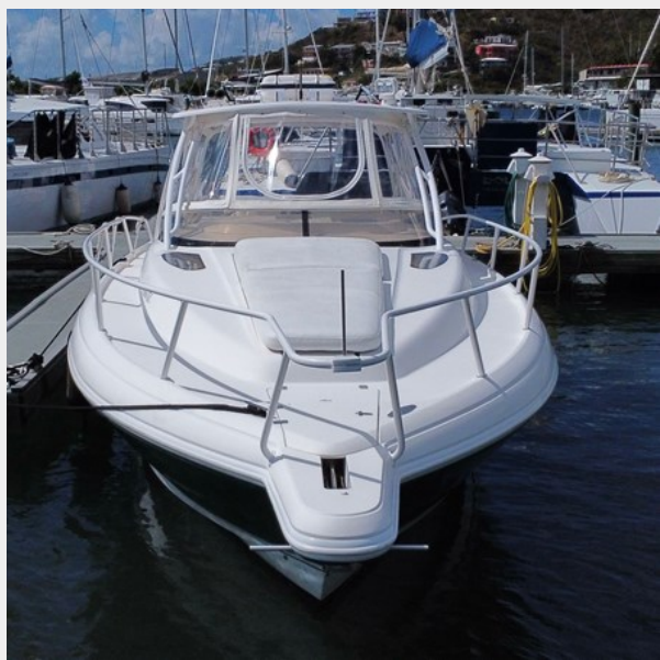
WhatsApp Image 2022-01-14 at 12.53.31 AM