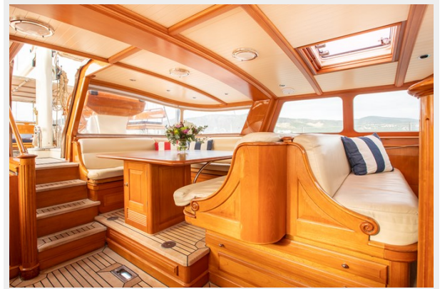
Pilothouse Port Side Aft