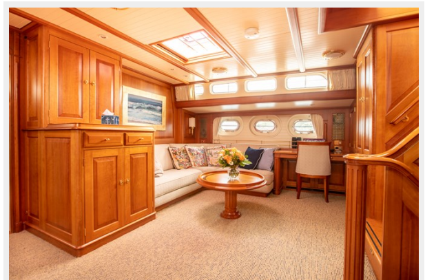
Salon Starboard Forward