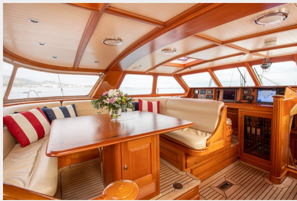
Pilothouse and Navigation Area