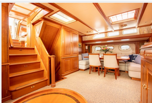
Salon Port Side