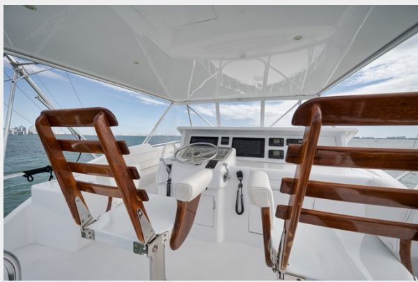
(2) Teak Murray Brothers Helm Seats