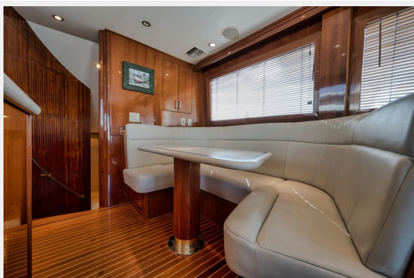
U-Shaped Ultra Leather Dinette, Reupholstered in 2017