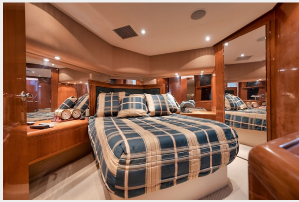
Master Stateroom Queen Berth with Under Storage