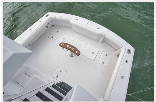
Looking at Cockpit from Flybridge