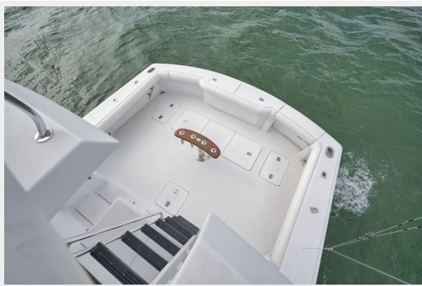
Cockpit View from Tower