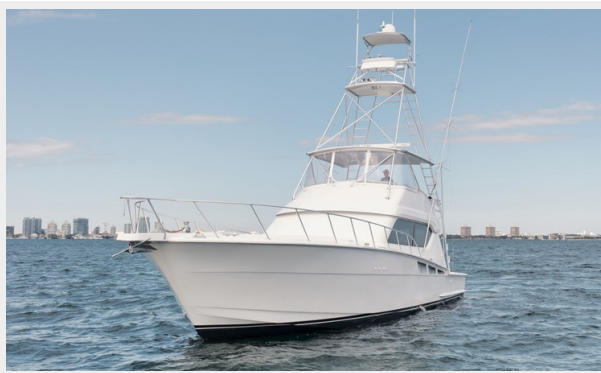
Port Bow Profile