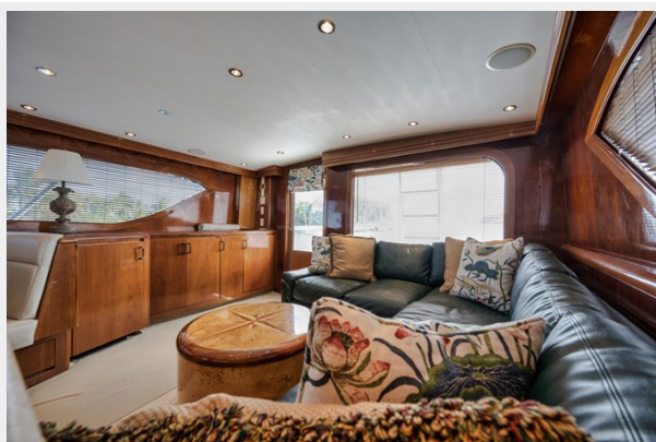
Salon Maple Interior, Blinds and Upholstered Valances