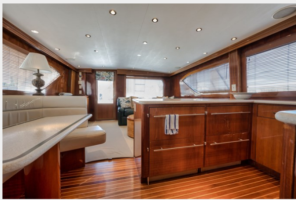
Teak and Holly Flooring