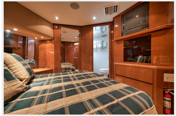
Master Stateroom Cedar Lined Closet