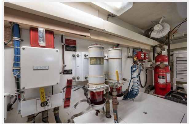
Engine Room to Starboard