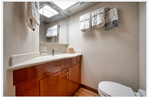
Master En-Suite Head