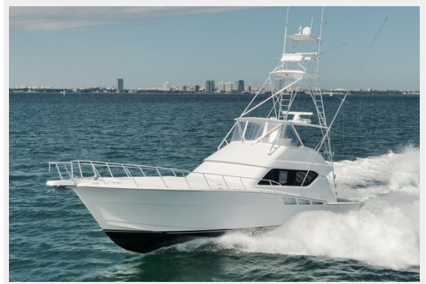
Port Bow Running View