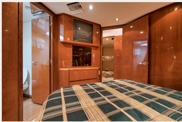
Master Stateroom Panasonic TV