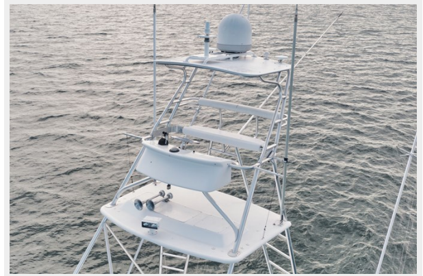
Tower and Tower Helm