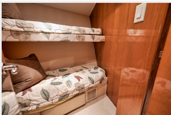
Guest Stateroom Starboard