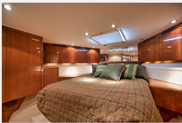
VIP Stateroom Queen Berth with Under Storage