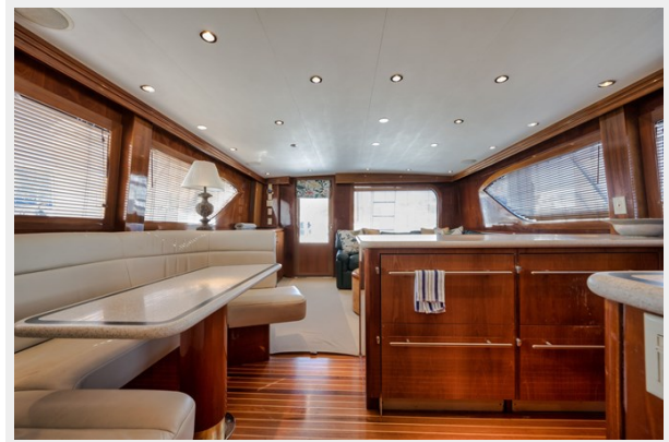
Dinette and Galley Looking Aft