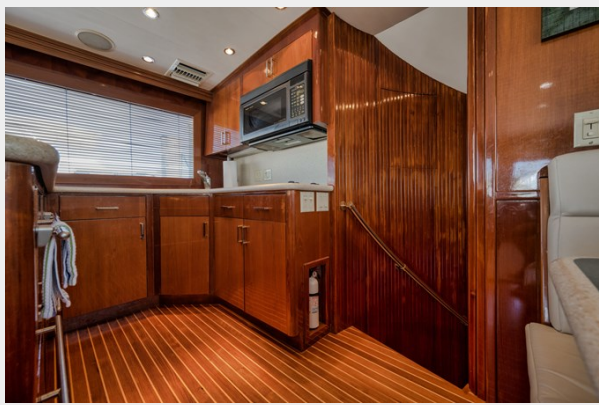
Galley Port Forward