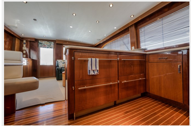
(2) Subzero Under Counter Refrigerator and (2) Subzero Under Counter Freezers