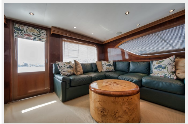
Salon L-Shaped Leather Sofa, Reupholstered 2017