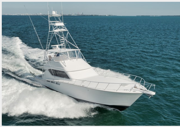
Starboard Bow Running View