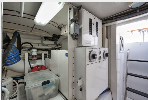
DC Switches and Generator On-Off Switches