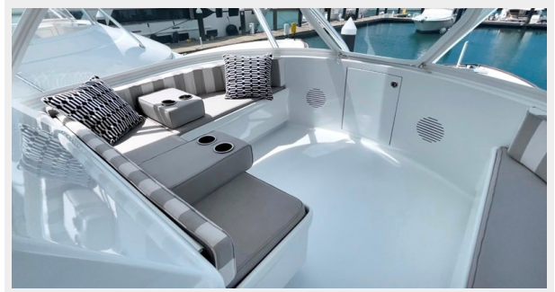
Flybridge Seating- Forward