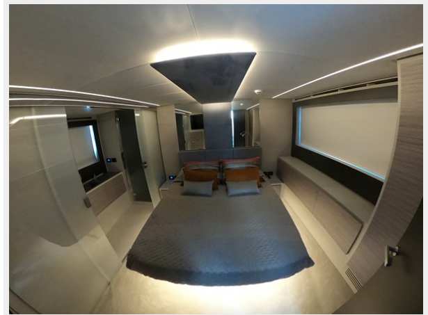
Master Blinds down