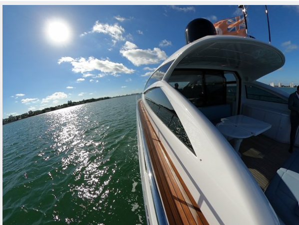
Port side deck