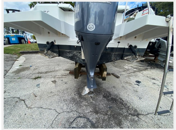
06-STERN - Copy