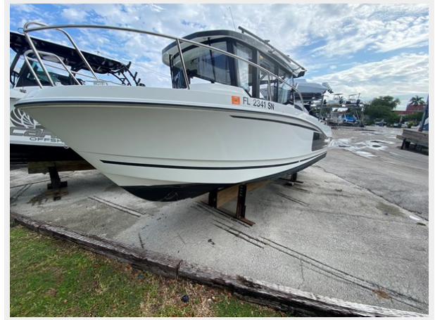
02-FRONT VIEW PORT SIDE