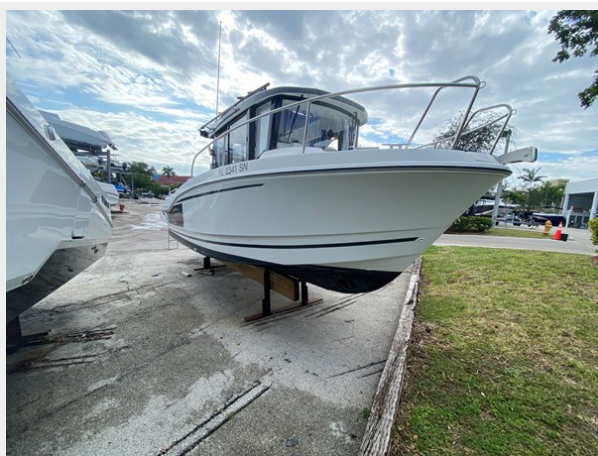
03-FRONT VIEW STARBOARD SIDE