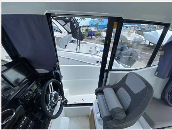
09-STARBOARD ENTRY DOOR