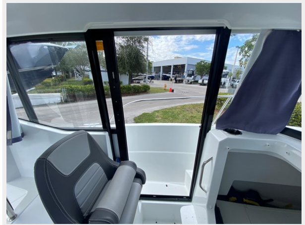
10-PORT SIDE ENTRY - Copy