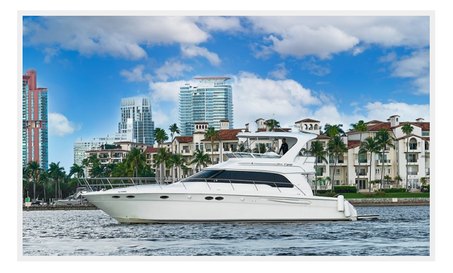
In it to Win it - Exterior view, Port Side