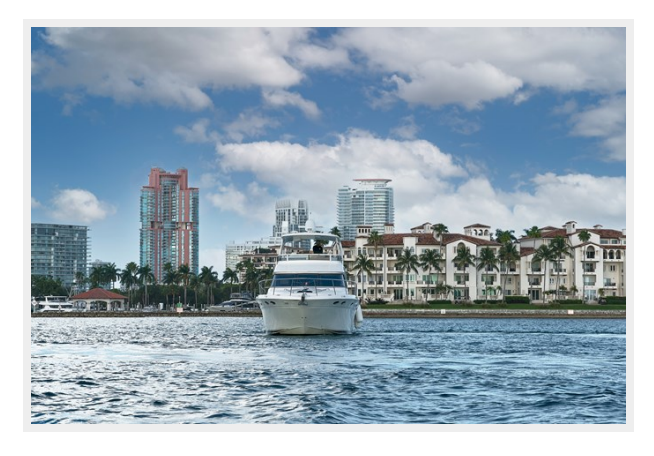
In it to Win it - Bow Area