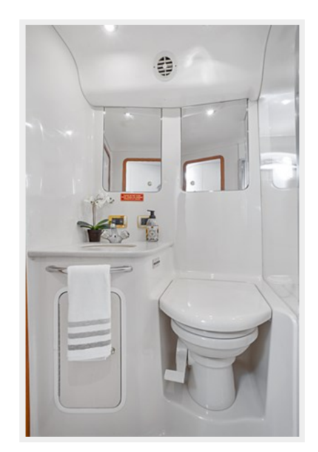
In it to Win it - Shared Head