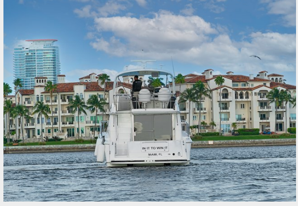
In it to Win it - Exterior view, Stern Area