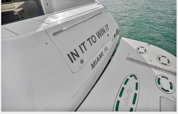
In it to Win it - Stern Area