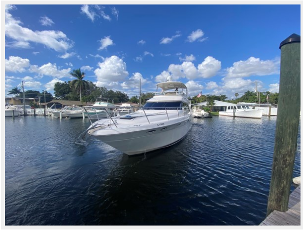
In it to Win it - Exterior view