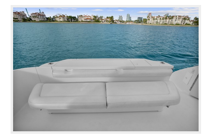
In it to Win it - Aft Deck Sitting Area