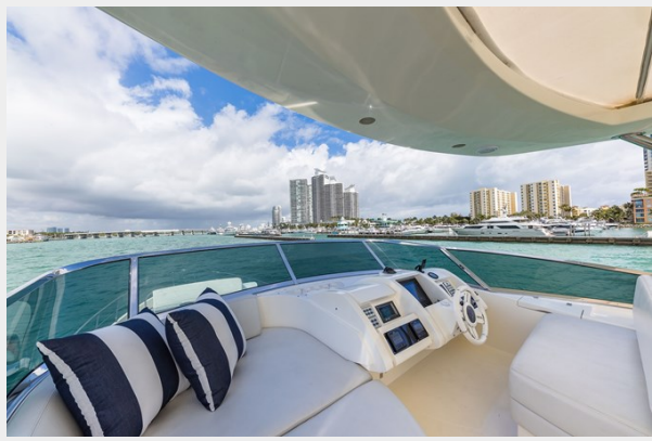
Minimal Risk - Flybridge Controls