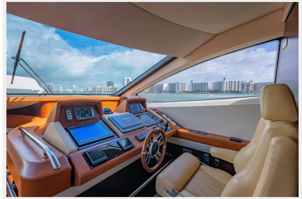
Minimal Risk - Controls