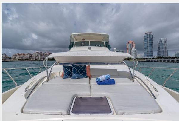
Minimal Risk - Bow Area