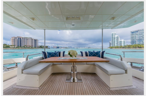
Minimal Risk - Aft Deck