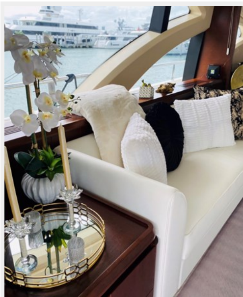
Minimal Risk - Main Salon