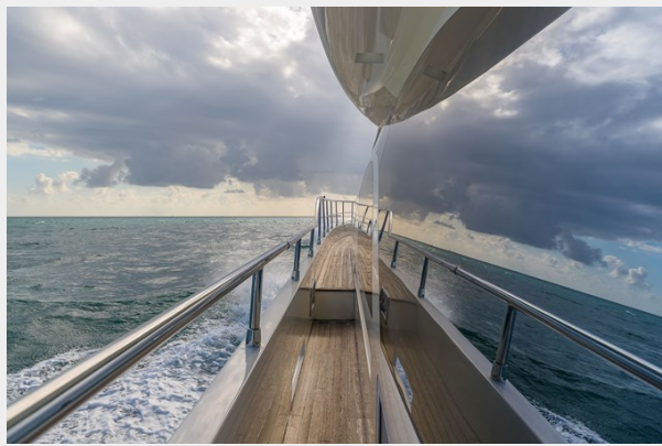
Minimal Risk - Bulwark