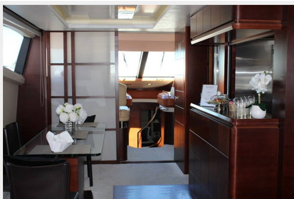
Minimal Risk - Dining Table