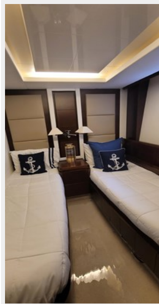
Minimal Risk - Port side Twin Stateroom