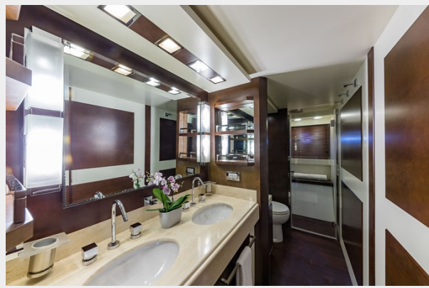
Minimal Risk - Master Head