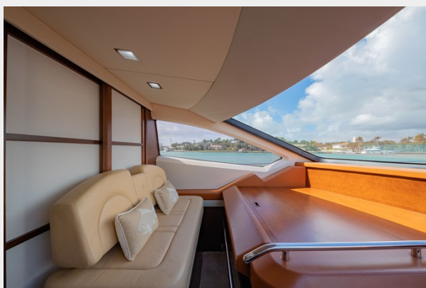
Minimal Risk - Helm