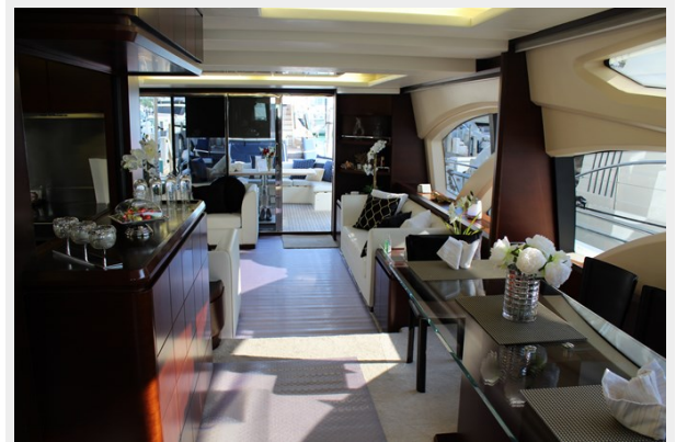
Minimal Risk - Main Salon and Dining Table