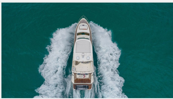
Minimal Risk - Exterior View