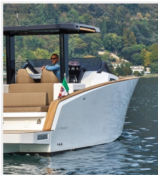
C Tender - Mauro Corvisieri