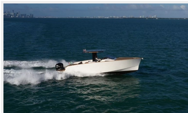
C Tender in Miami 3