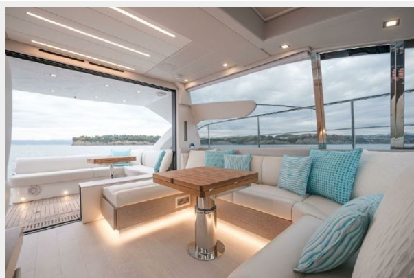
brandon filippetti 2