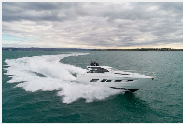
brandon filippetti 8