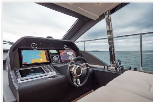
brandon filippetti 3