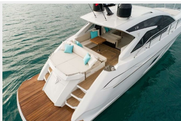
brandon filippetti 6