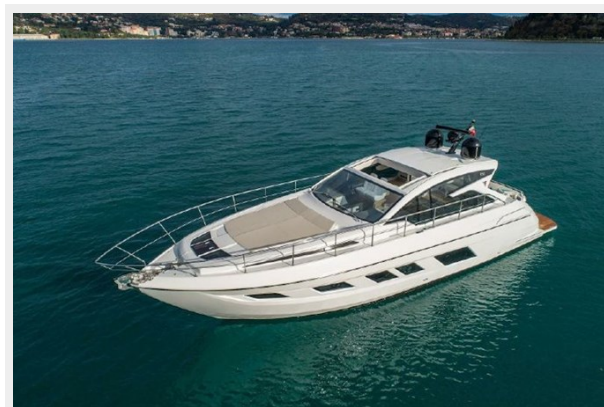
brandon filippetti 5