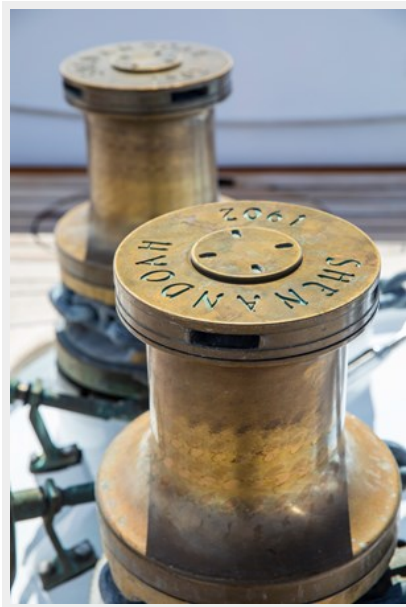
Decoration detail of SHENANDOAH OF SARK