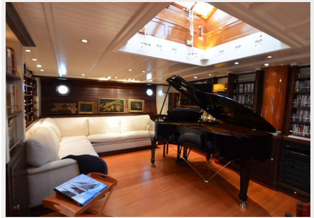
Lower deck saloon