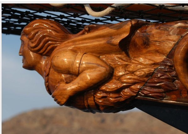
Decoration detail of SHENANDOAH OF SARK