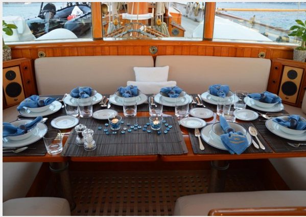
Main deck exterior dining area