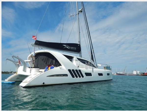
jeff s cattitude 21