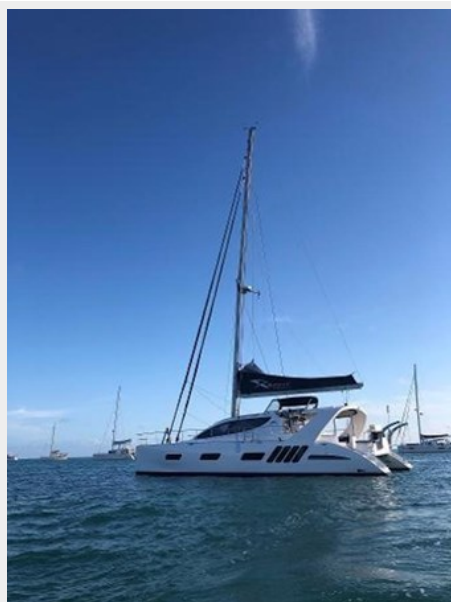
jeff s cattitude 23