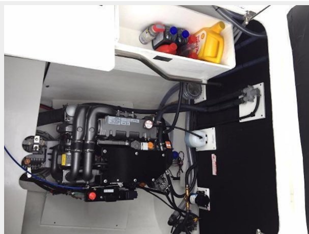
jeff s cattitude 17