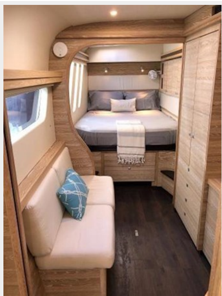
jeff s cattitude 9