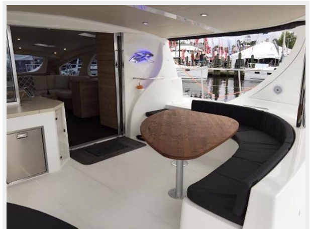
jeff s cattitude 18