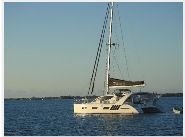
jeff s cattitude 22