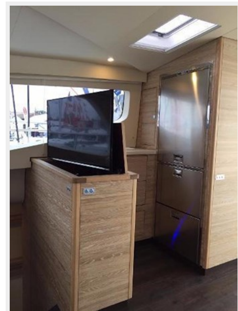
jeff s cattitude 6