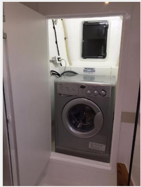
jeff s cattitude 11