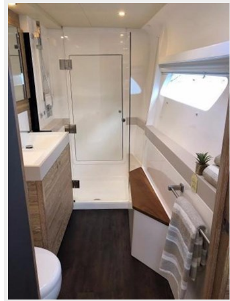
jeff s cattitude 16