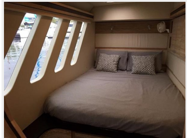
jeff s cattitude 8