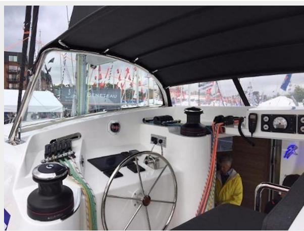
jeff s cattitude 19