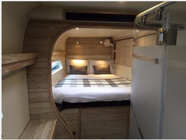
jeff s cattitude 15