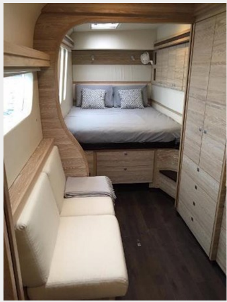
jeff s cattitude 7