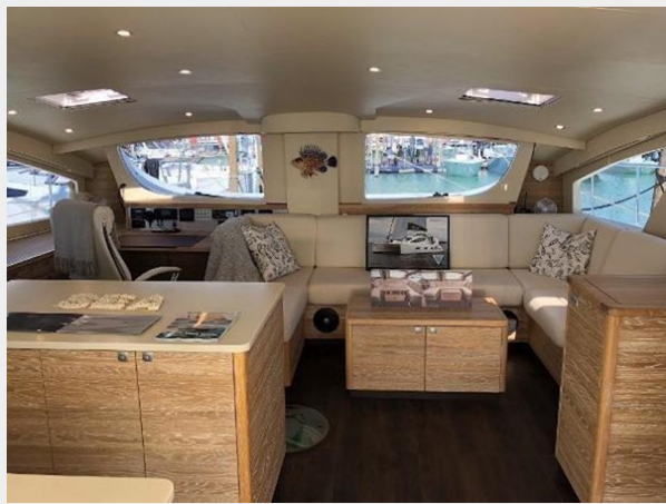
jeff s cattitude 3