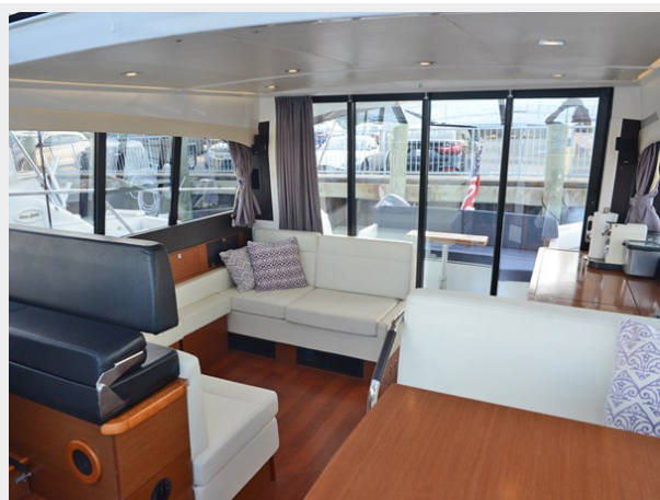
Salon, Looking Aft