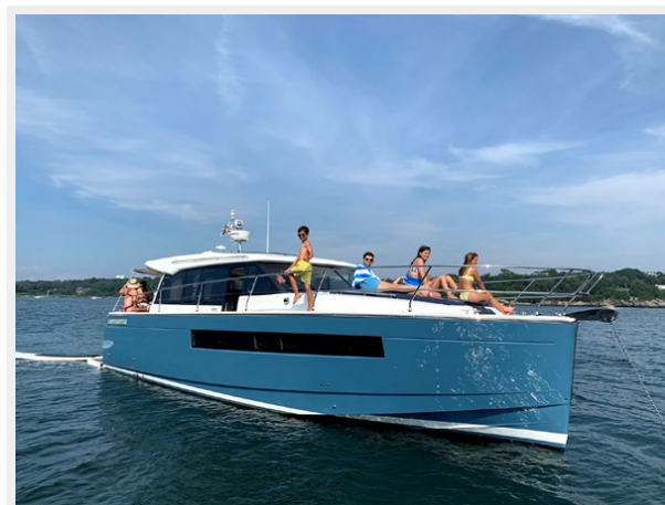
Crew on Bow, Underway