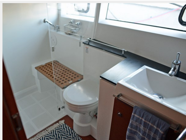
Owner's Head and Shower