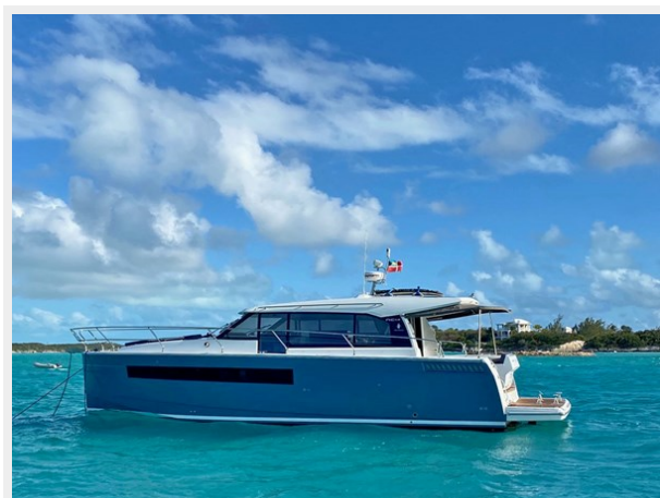
Port Side at Anchor