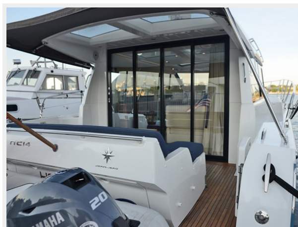
Aft Cockpit from Dock