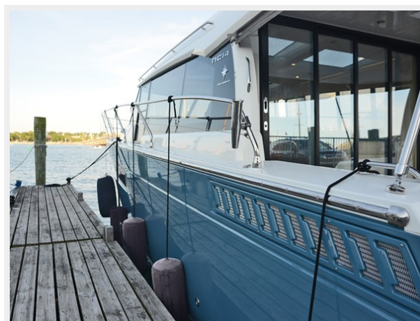
Port Quarter from Dock