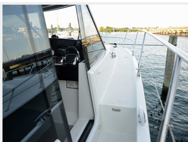
Helm Door on Stbd Side Deck