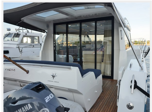
Aft Cockpit from Dock