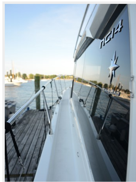
Port Side Deck