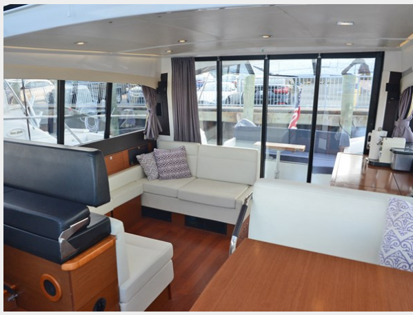
Salon, Looking Aft