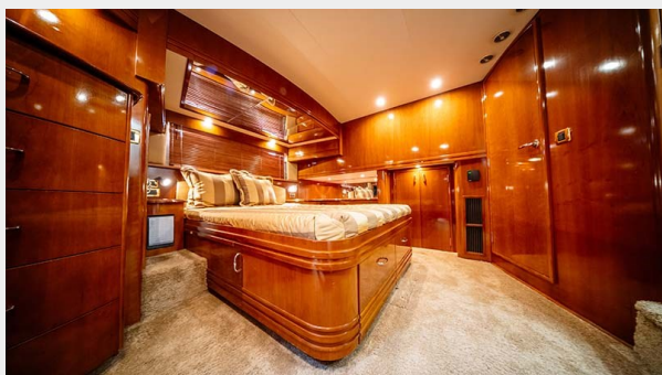
013 Owner Stateroom