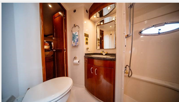
025 Guest Head