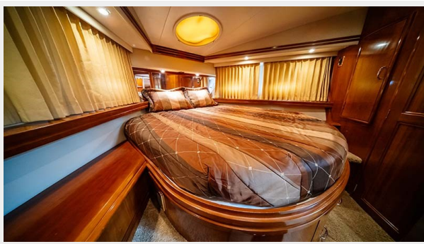
019 VIP Stateroom