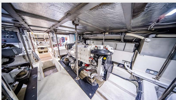
033 Engine Room