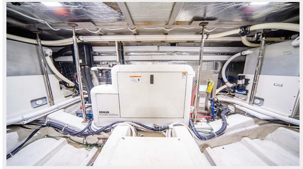
032 Engine Room