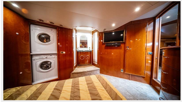
016 Owner Stateroom