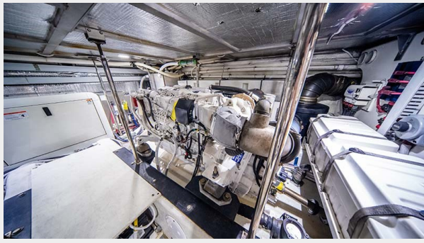
031 Engine Room