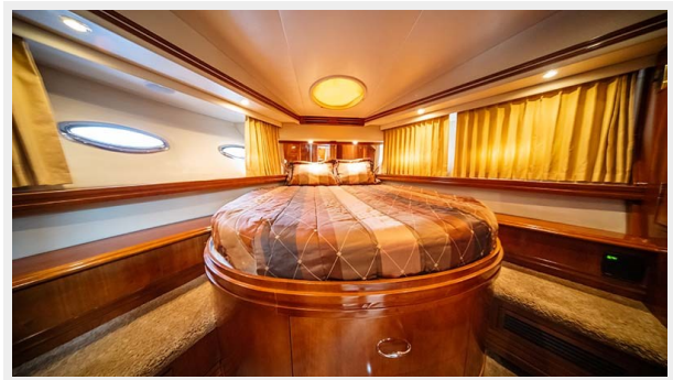
020 VIP Stateroom