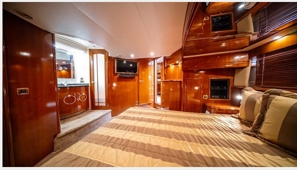
015 Owner Stateroom