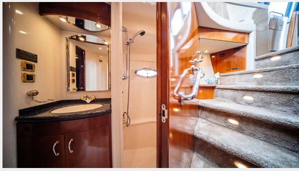
023 Guest Head