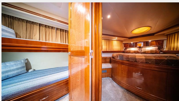
021 Guest Stateroom