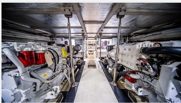
035 Engine Room