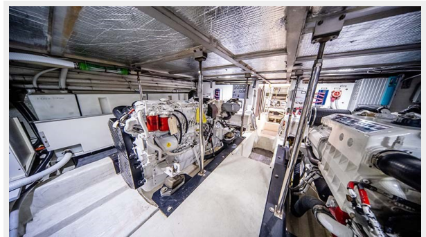
034 Engine Room