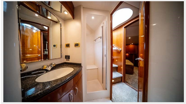
024 Guest head