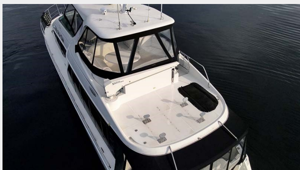
037 Upper Deck copy