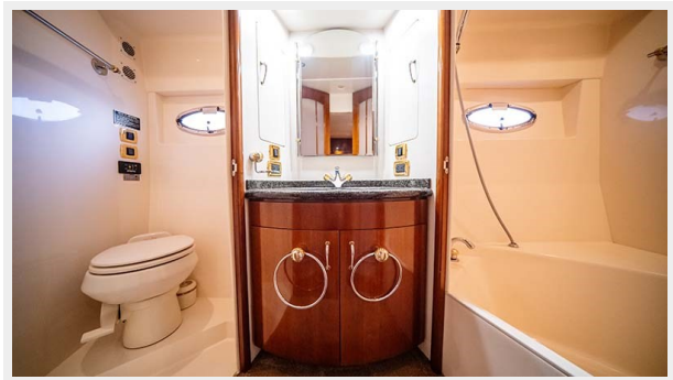
018 Owner Head