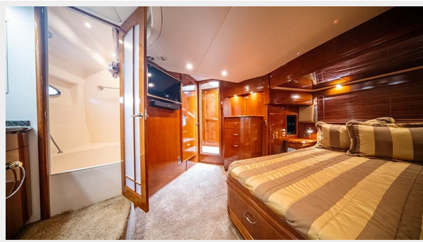
017 Owner Stateroom