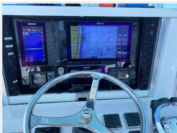
22_2009 41ft Bahama 41 ON THE EDGE