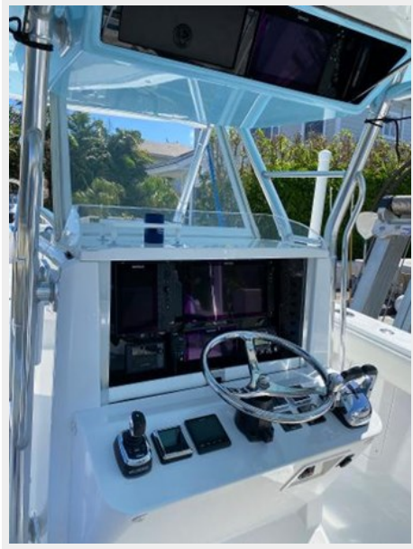
24_2009 41ft Bahama 41 ON THE EDGE