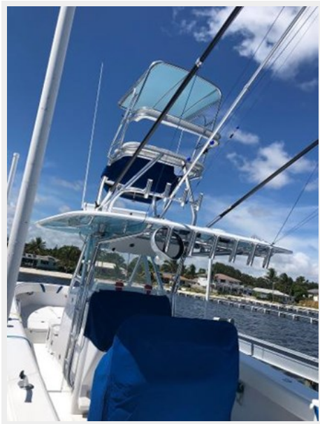
4_2009 41ft Bahama 41 ON THE EDGE