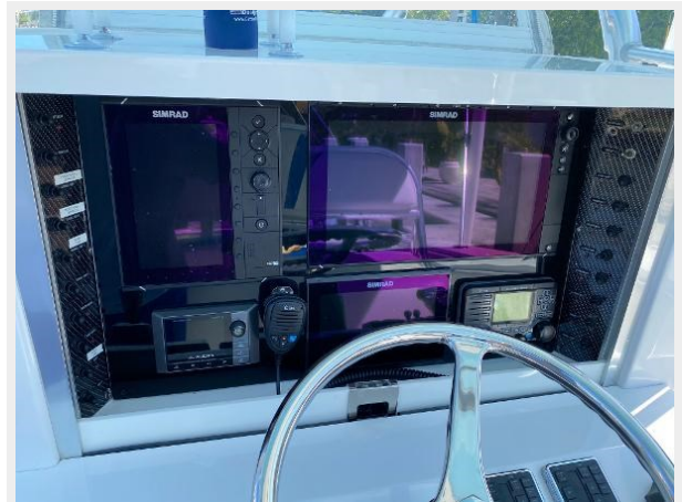
21_2009 41ft Bahama 41 ON THE EDGE