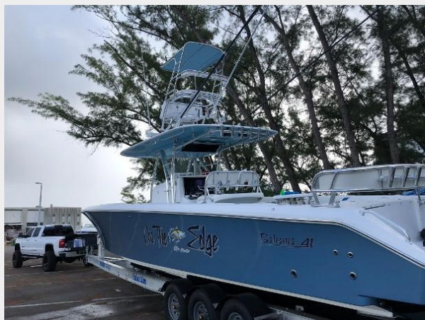
8_2009 41ft Bahama 41 ON THE EDGE