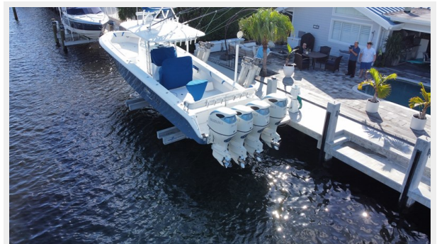
15_2009 41ft Bahama 41 ON THE EDGE