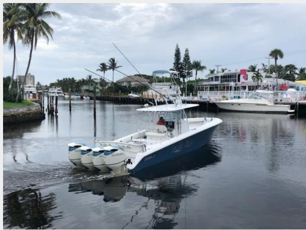
2_2009 41ft Bahama 41 ON THE EDGE