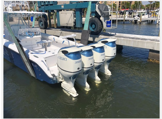
13_2009 41ft Bahama 41 ON THE EDGE