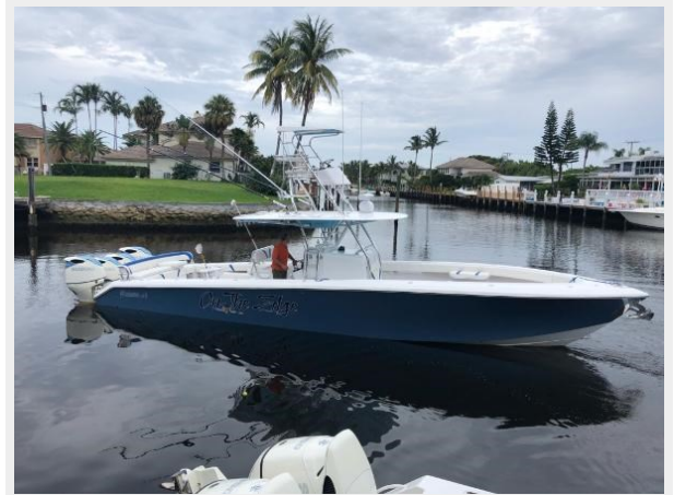
3_2009 41ft Bahama 41 ON THE EDGE