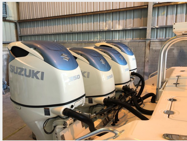
18_2009 41ft Bahama 41 ON THE EDGE