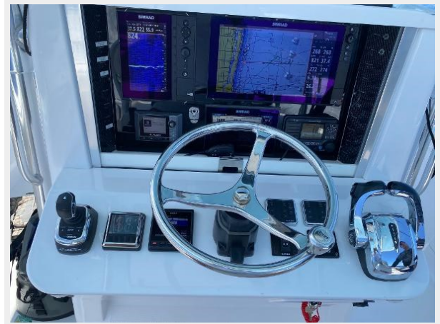
19_2009 41ft Bahama 41 ON THE EDGE