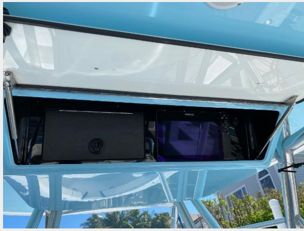
6_2009 41ft Bahama 41 ON THE EDGE