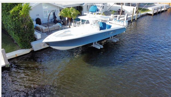
16_2009 41ft Bahama 41 ON THE EDGE