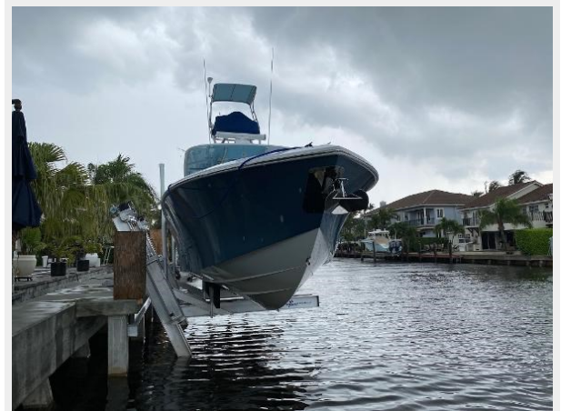
9_2009 41ft Bahama 41 ON THE EDGE