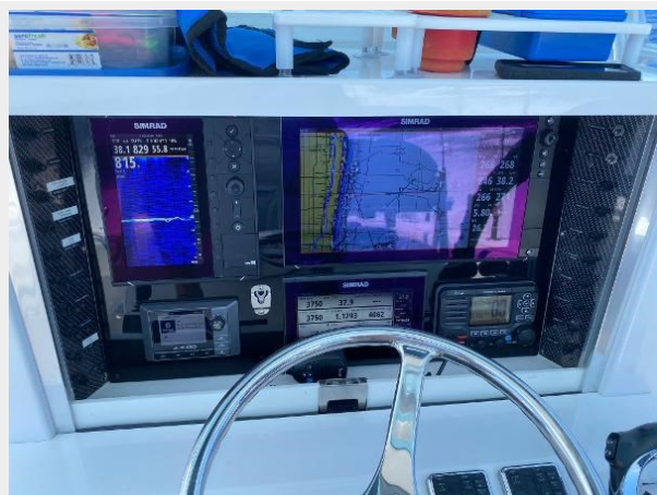
20_2009 41ft Bahama 41 ON THE EDGE