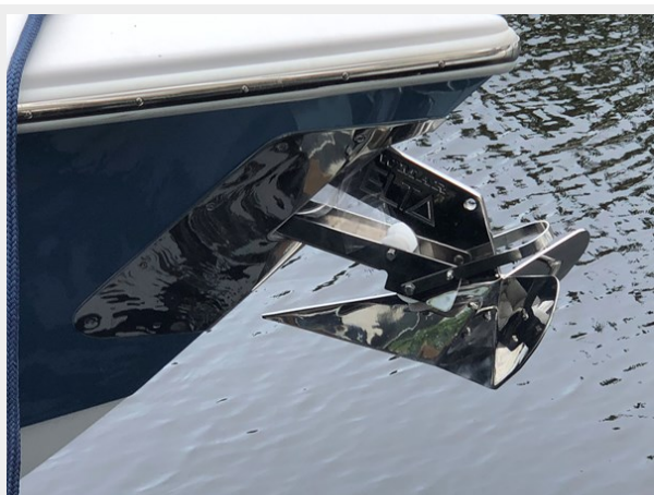
28_2009 41ft Bahama 41 ON THE EDGE