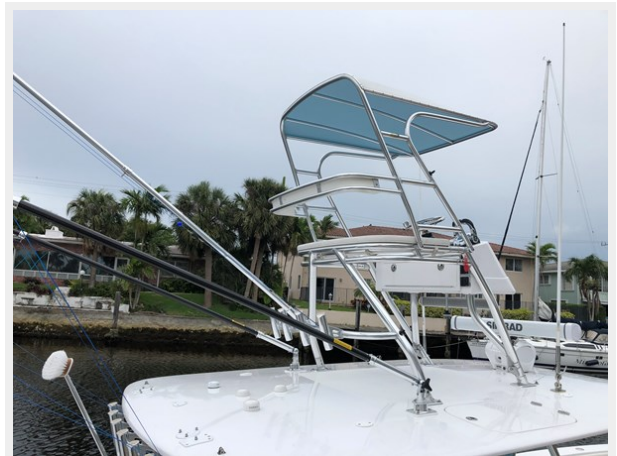
27_2009 41ft Bahama 41 ON THE EDGE