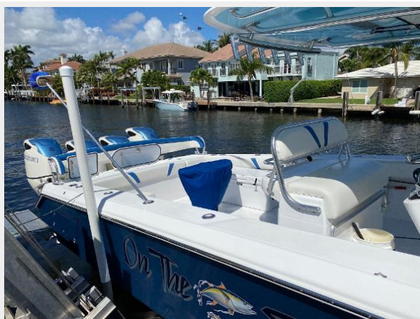
10_2009 41ft Bahama 41 ON THE EDGE