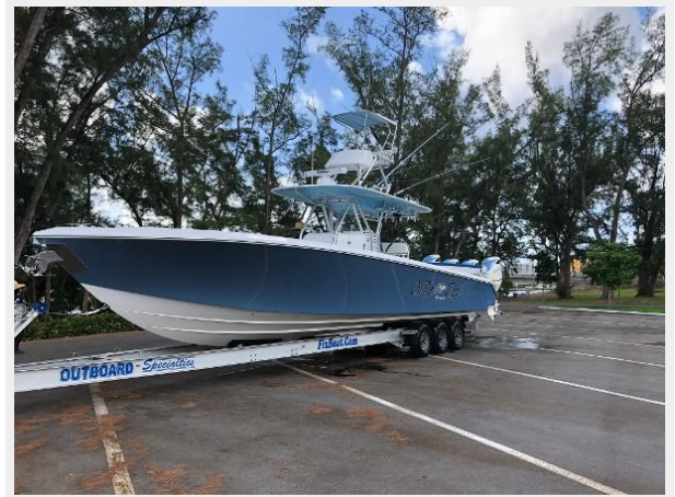
7_2009 41ft Bahama 41 ON THE EDGE