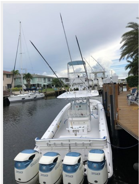
14_2009 41ft Bahama 41 ON THE EDGE