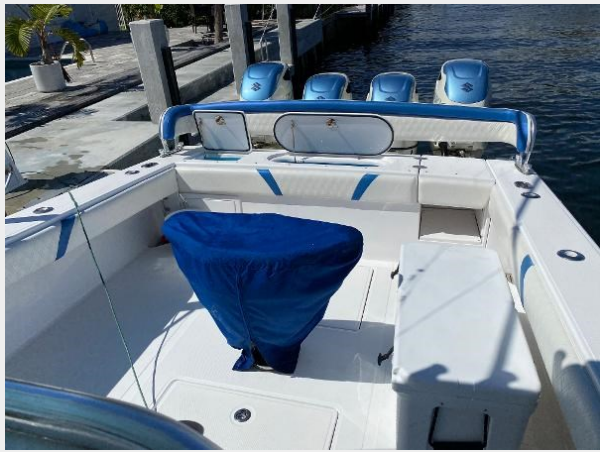
12_2009 41ft Bahama 41 ON THE EDGE