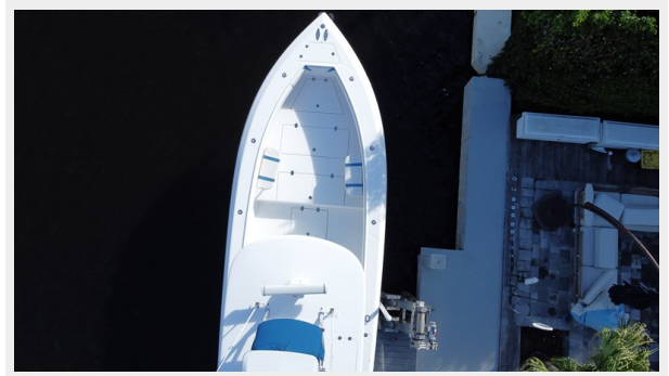
25_2009 41ft Bahama 41 ON THE EDGE