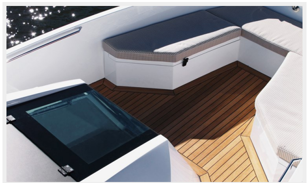
5 Bow Seating