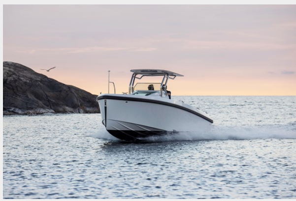
2 Port Bow Running Profile