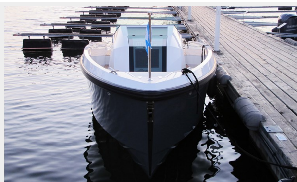
4 Bow View