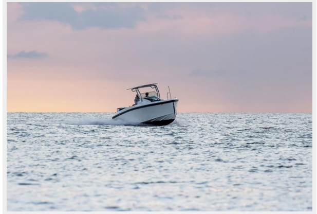
3 Starboard Bow Running Profile