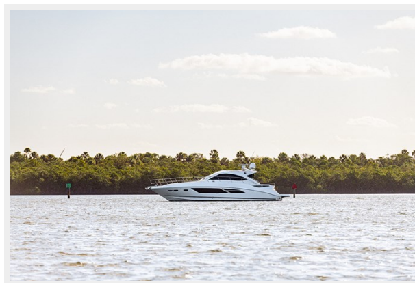
SEARAY _ Brett Jenkins _ Opal Moon Media (4 of 12) SEARAY _ Brett Jenkins _ Opal Moon Media (5 of 12)