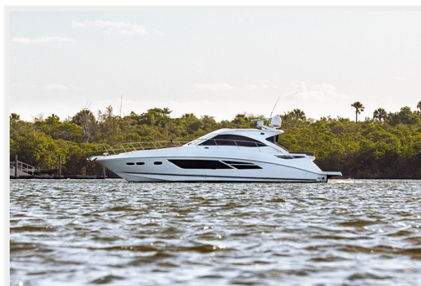
SEARAY _ Brett Jenkins _ Opal Moon Media (6 of 12) SEARAY _ Brett Jenkins _ Opal Moon Media (7 of 12)