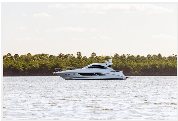
SEARAY _ Brett Jenkins _ Opal Moon Media (1 of 12) SEARAY _ Brett Jenkins _ Opal Moon Media (3 of 12)