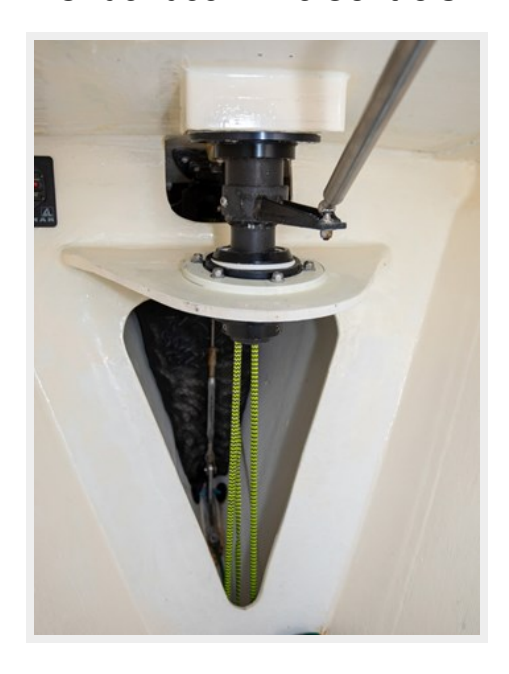
Under-deck Line Controls