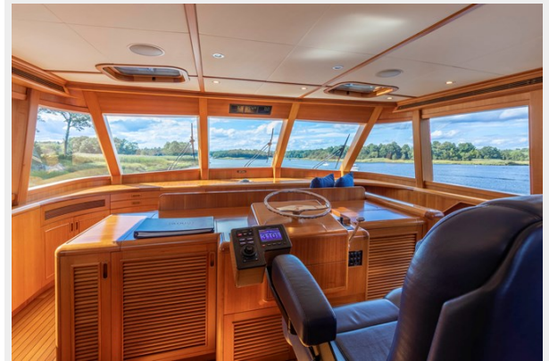
Skylounge Mode - No Instruments