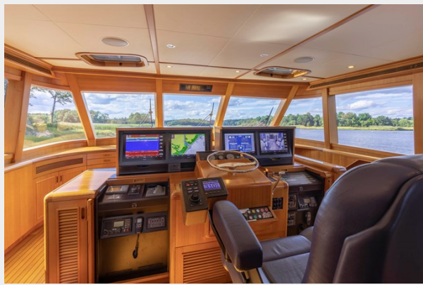
Pilothouse - Helm with Instruments