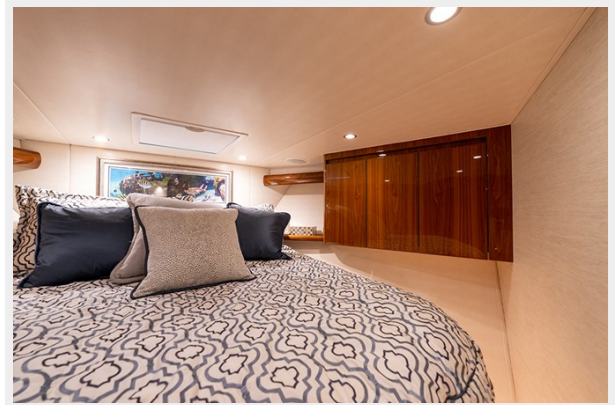
Master stateroom view 2