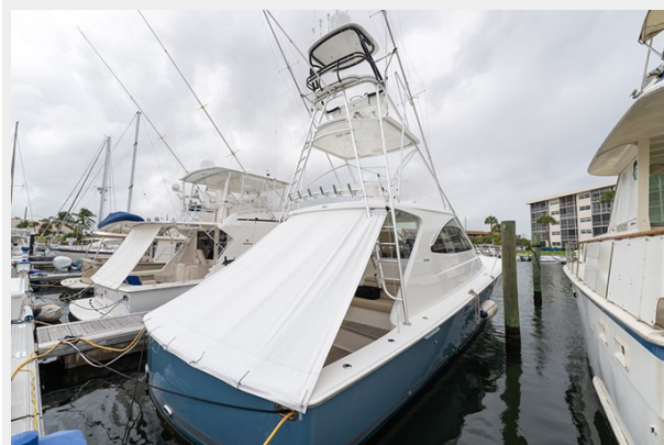
Stbd quarter profile