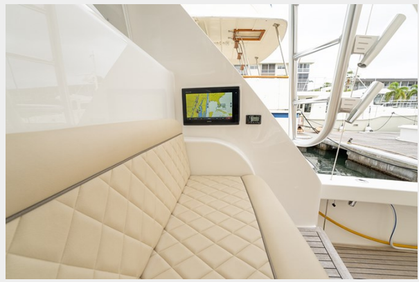
Stbd fwd cockpit seating