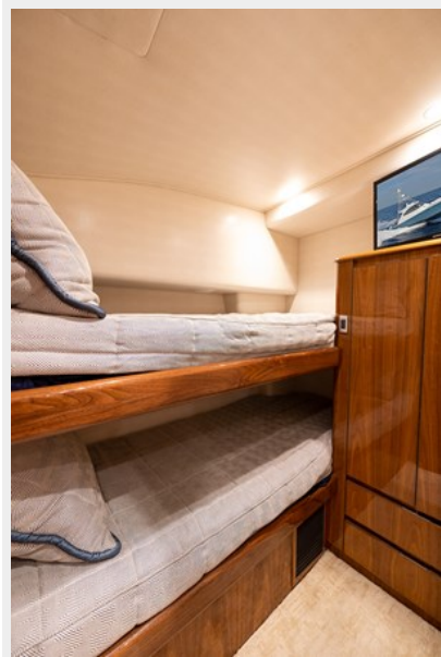
Guest stateroom 1