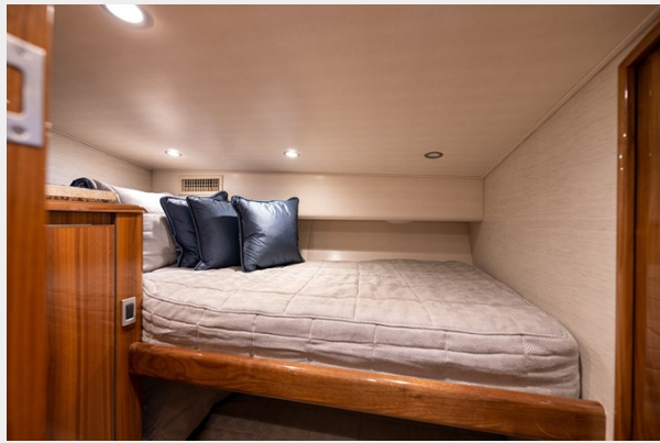
Guest stateroom 2