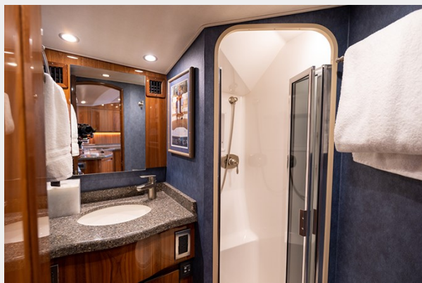
Guest shower with vanity