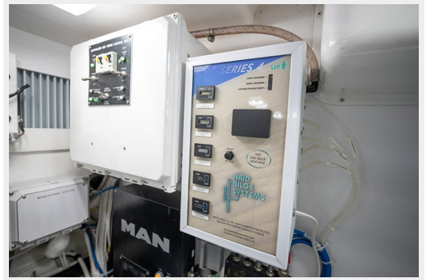
Arid bilge system