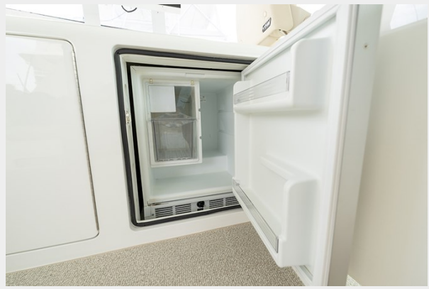
Refrigerator at the flybridge