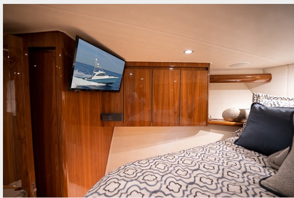
TV in the master stateroom