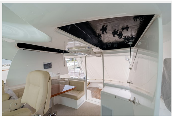
Flybridge looking aft