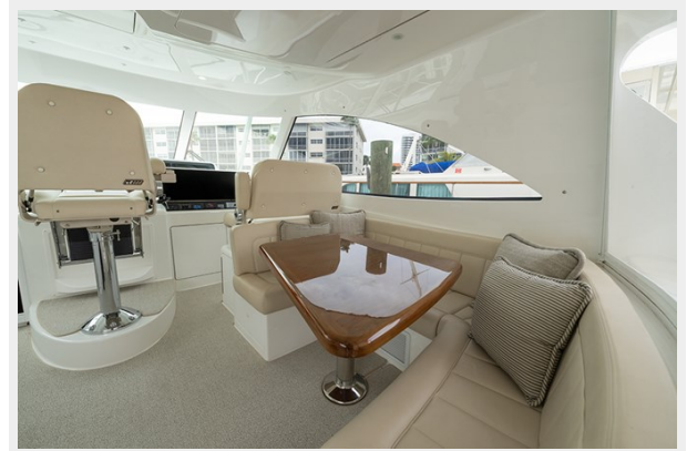
Flybridge view 2