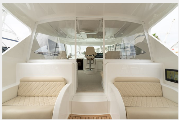
Entry to the flybridge