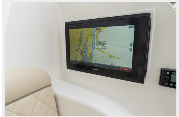
Garmin in the cockpit