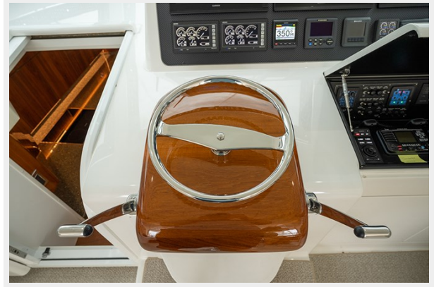
Release teak helm pod