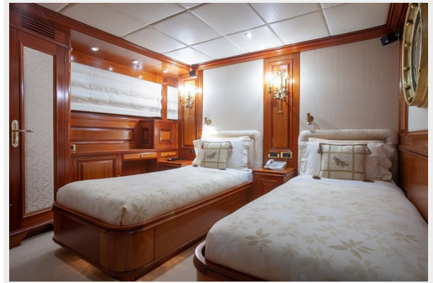
Twin Stateroom #2