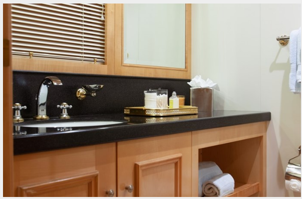
Twin Stateroom Ensuite