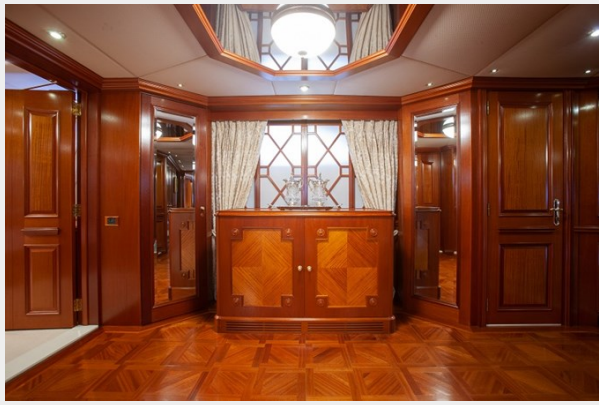
Dining Room Foyer