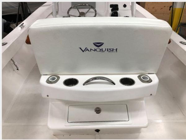
Helm Chair Backrest