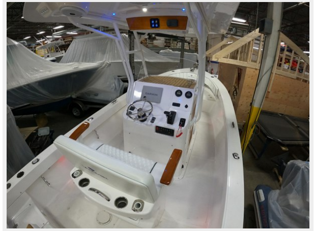
Console and Helm Seat