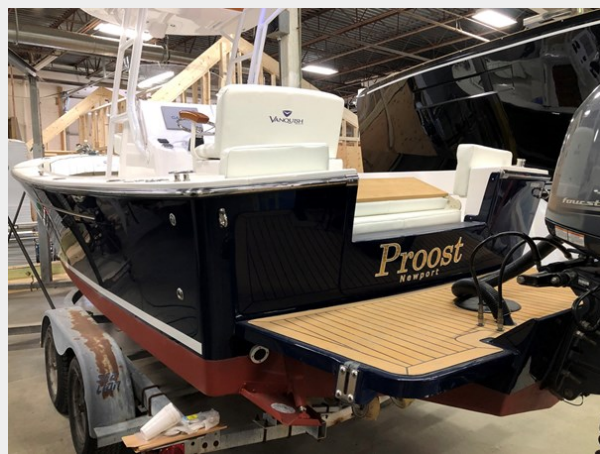
Stern Quarter below and behind