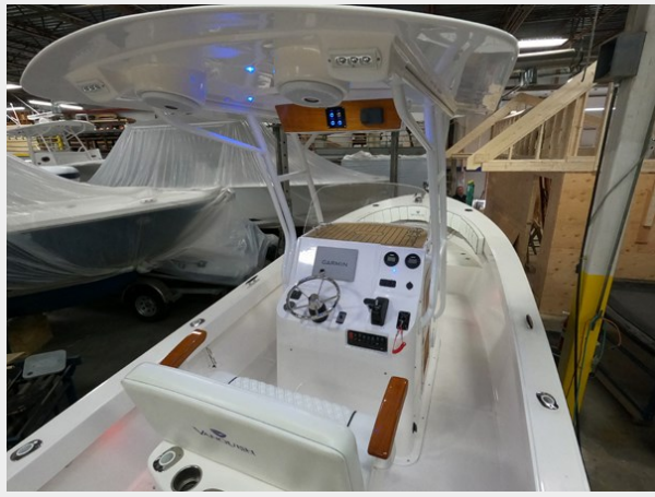
T Top Detail