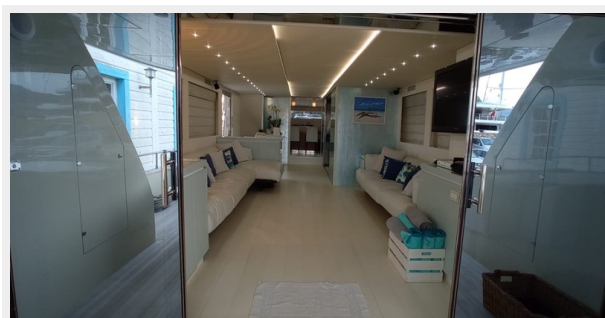
LARGE LIVING ROOM WITH TWO SOFAS