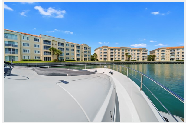
11 _ 2006 65ft Marquis Motor Yacht Pilot House OFF THE GRID