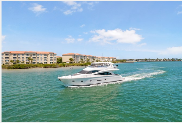
2 _ 2006 65ft Marquis Motor Yacht Pilot House OFF THE GRID