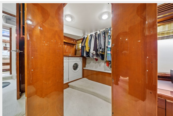
30 _ 2006 65ft Marquis Motor Yacht Pilot House OFF THE GRID