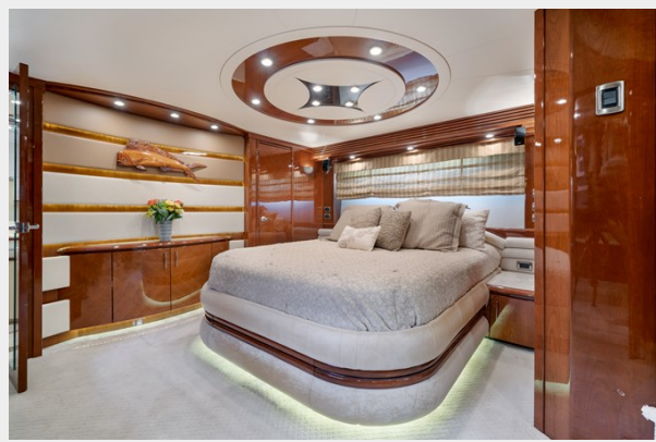
28 _ 2006 65ft Marquis Motor Yacht Pilot House OFF THE GRID