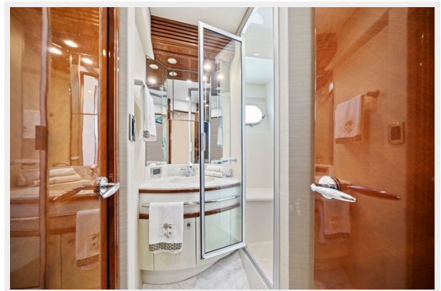
35 _ 2006 65ft Marquis Motor Yacht Pilot House OFF THE GRID