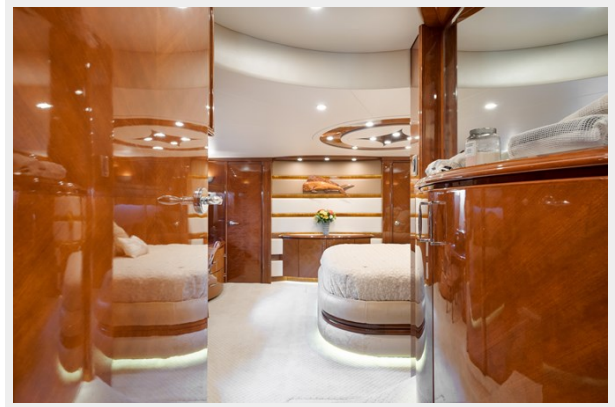
27 _ 2006 65ft Marquis Motor Yacht Pilot House OFF THE GRID