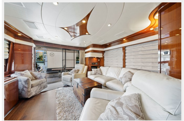
23 _ 2006 65ft Marquis Motor Yacht Pilot House OFF THE GRID