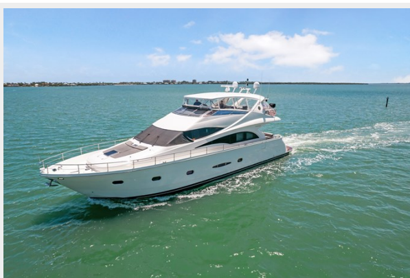
6 _ 2006 65ft Marquis Motor Yacht Pilot House OFF THE GRID