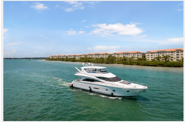
3 _ 2006 65ft Marquis Motor Yacht Pilot House OFF THE GRID