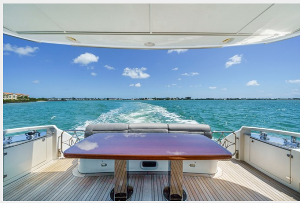
20 _ 2006 65ft Marquis Motor Yacht Pilot House OFF THE GRID