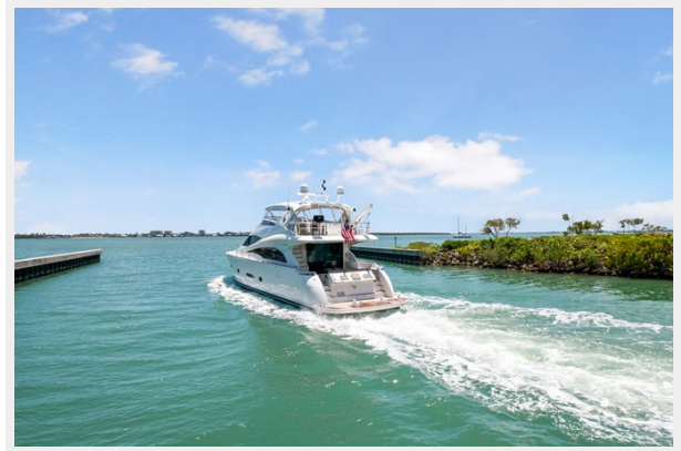
9 _ 2006 65ft Marquis Motor Yacht Pilot House OFF THE GRID