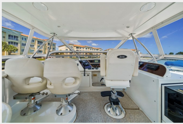
14 _ 2006 65ft Marquis Motor Yacht Pilot House OFF THE GRID