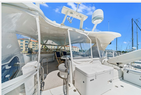
18 _ 2006 65ft Marquis Motor Yacht Pilot House OFF THE GRID