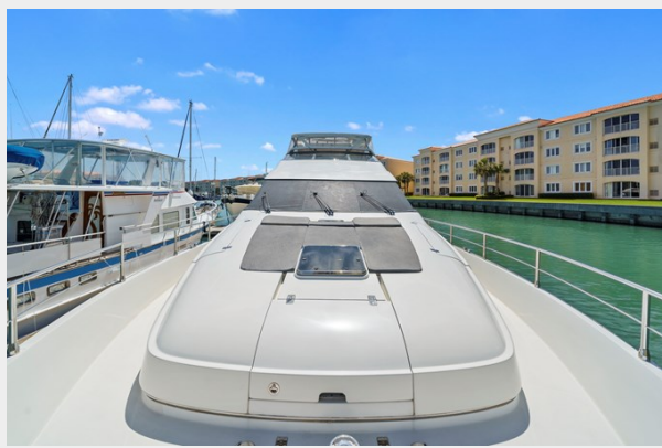
10 _ 2006 65ft Marquis Motor Yacht Pilot House OFF THE GRID