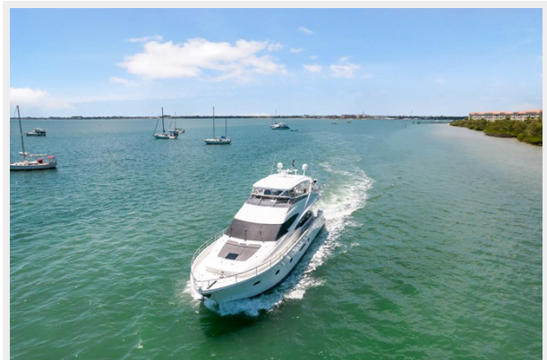
5 _ 2006 65ft Marquis Motor Yacht Pilot House OFF THE GRID