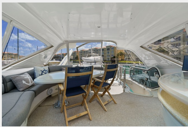
16 _ 2006 65ft Marquis Motor Yacht Pilot House OFF THE GRID