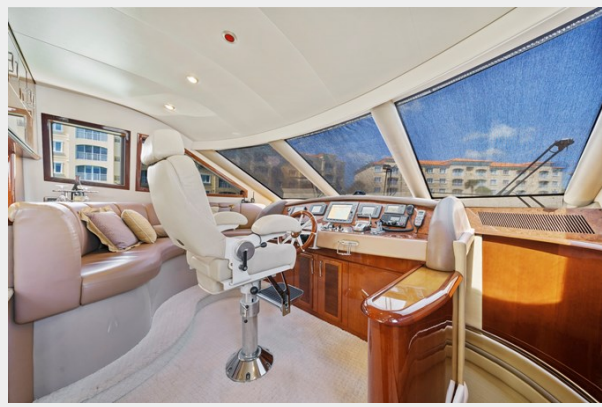
26 _ 2006 65ft Marquis Motor Yacht Pilot House OFF THE GRID