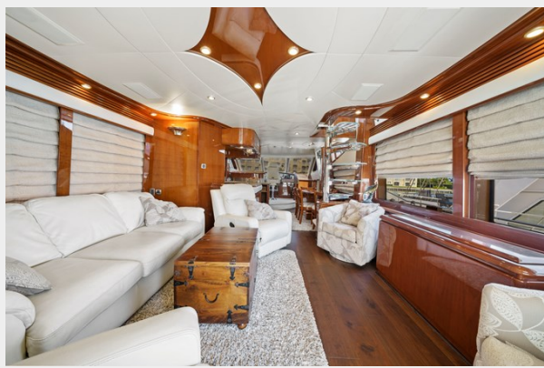
22 _ 2006 65ft Marquis Motor Yacht Pilot House OFF THE GRID