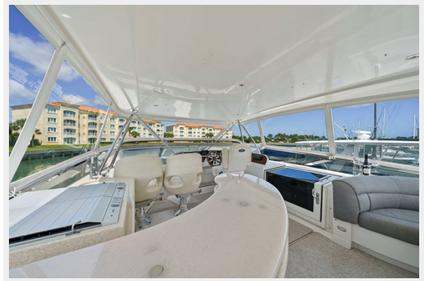
15 _ 2006 65ft Marquis Motor Yacht Pilot House OFF THE GRID