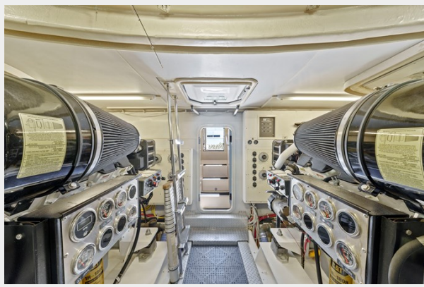
38 _ 2006 65ft Marquis Motor Yacht Pilot House OFF THE GRID