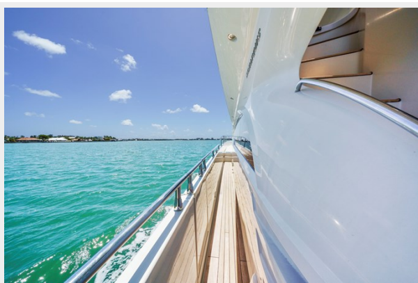
12 _ 2006 65ft Marquis Motor Yacht Pilot House OFF THE GRID