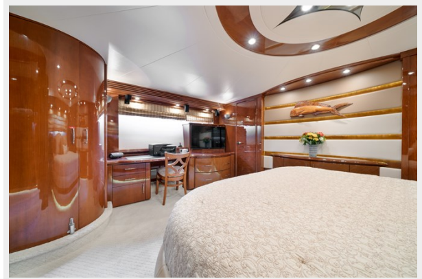
29 _ 2006 65ft Marquis Motor Yacht Pilot House OFF THE GRID