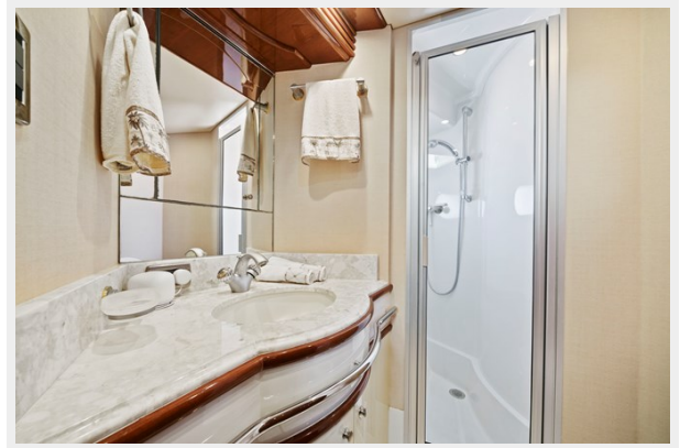
33 _ 2006 65ft Marquis Motor Yacht Pilot House OFF THE GRID