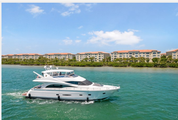
4 _ 2006 65ft Marquis Motor Yacht Pilot House OFF THE GRID