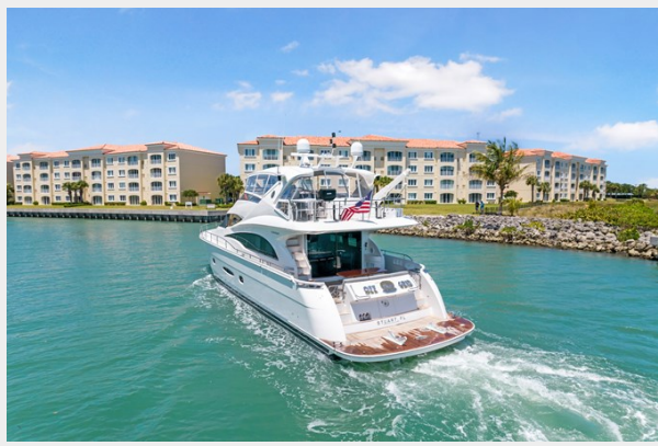
8 _ 2006 65ft Marquis Motor Yacht Pilot House OFF THE GRID