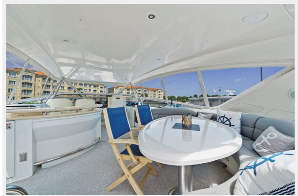
17 _ 2006 65ft Marquis Motor Yacht Pilot House OFF THE GRID