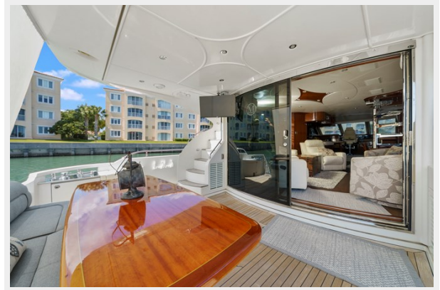
21 _ 2006 65ft Marquis Motor Yacht Pilot House OFF THE GRID