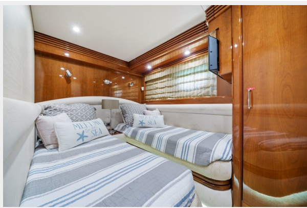
34 _ 2006 65ft Marquis Motor Yacht Pilot House OFF THE GRID