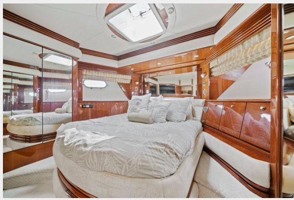
32 _ 2006 65ft Marquis Motor Yacht Pilot House OFF THE GRID