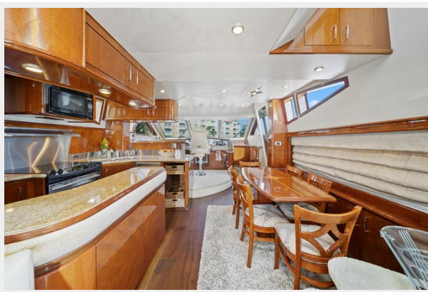
24 _ 2006 65ft Marquis Motor Yacht Pilot House OFF THE GRID