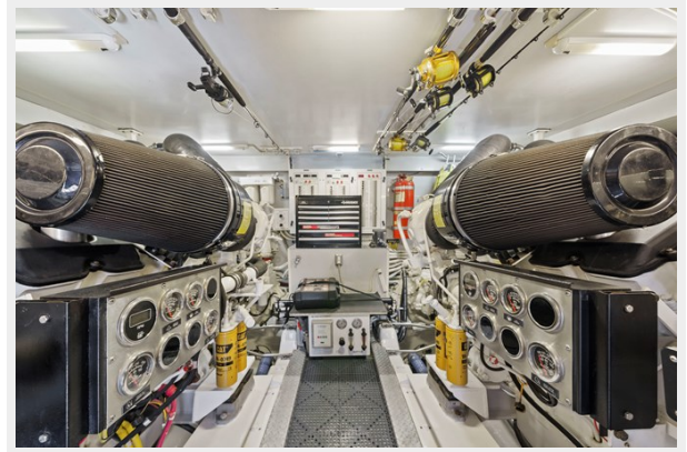
39 _ 2006 65ft Marquis Motor Yacht Pilot House OFF THE GRID